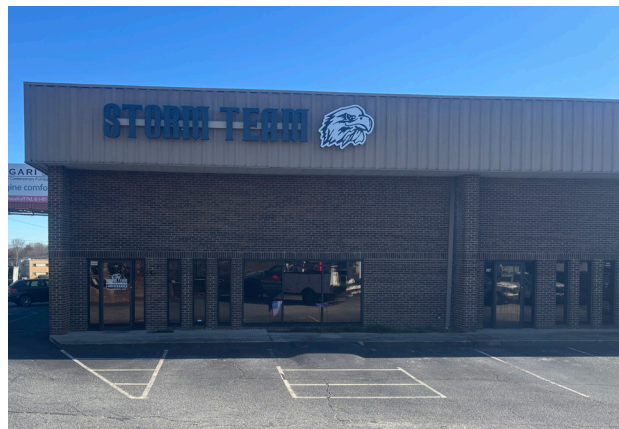
GREENVILLE COUNTY TAX MAP #0533020105100