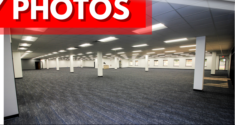
Possible Work Station Area