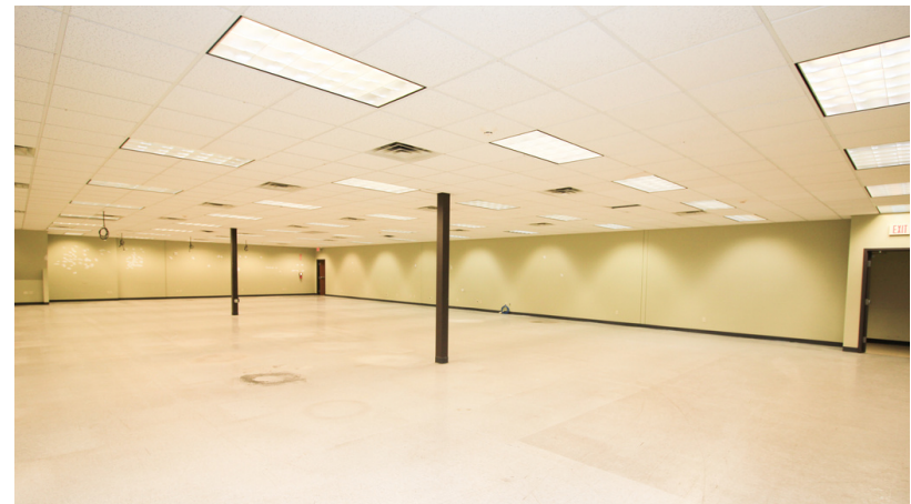
Spacious Open Area