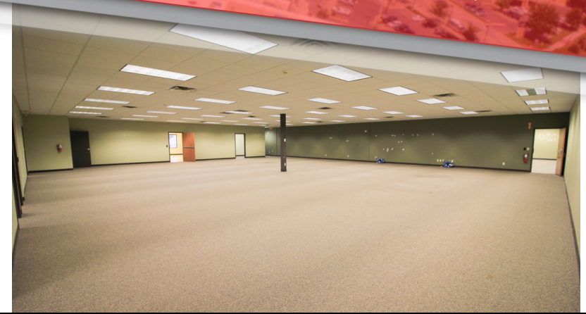
Spacious Open Area