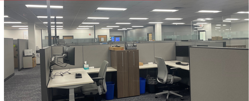
Large Area for Workstations