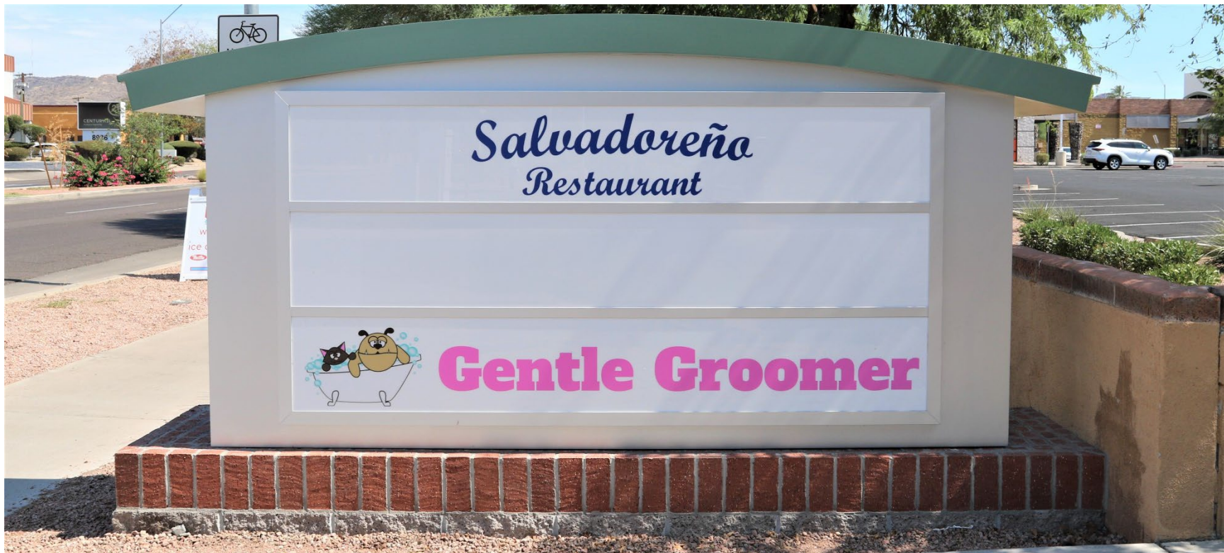
Dedicated Monument Sign on North Central Avenue

RAMSEY REAL ESTATE GROUP AND THE PROPERTY OWNER HAVE COMMON OWNERSHIP INTERESTS. SITE PLAN, ELEVATIONS AND OCCUPANTS ARE SUBJECT TO CHANGE. NO GUARANTEE, WARRANTY OR REPRESENTATION IS MADE WITH RESPECT TO THE DATA, DESIGN, LAYOUT OR ANY OTHER ASPECT OF THE CONSTRUCTION, DEMISING, APPEARANCE OR OCCUPANCY OF THE PROJECT.