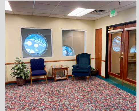
Executive-style entry with waiting area and reception/work space.