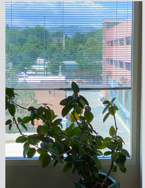
West facing offices feature abundant natural light with large windows and mountain views.