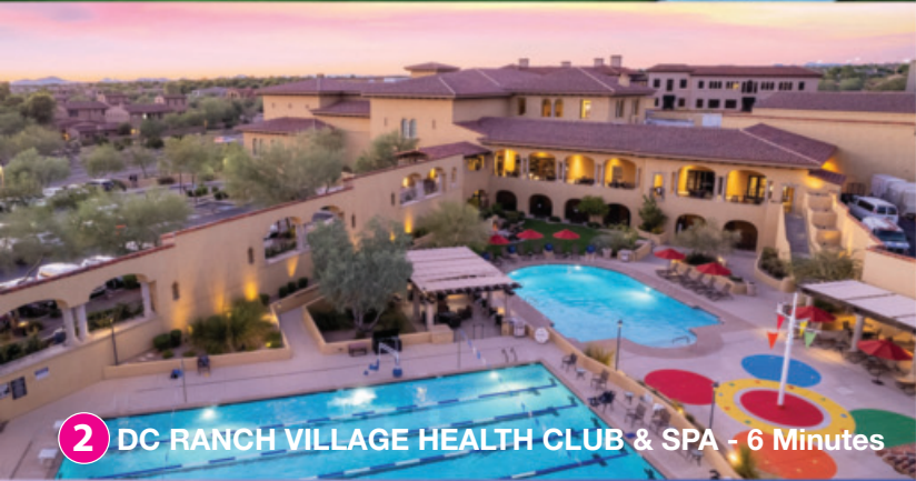
2 DC RANCH VILLAGE HEALTH CLUB & SPA - 6 Minutes