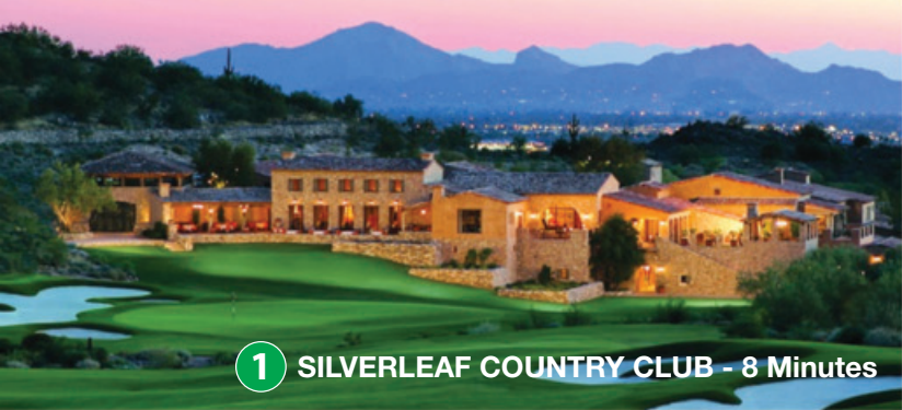
1 SILVERLEAF COUNTRY CLUB - 8 Minutes