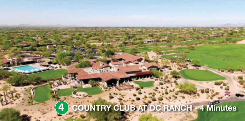
4 COUNTRY CLUB AT DC RANCH - 4 Minutes