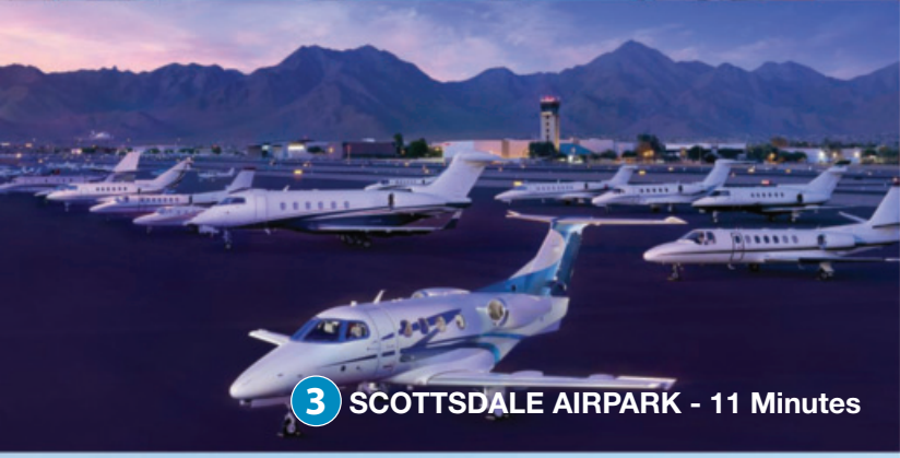
3 SCOTTSDALE AIRPARK - 11 Minutes