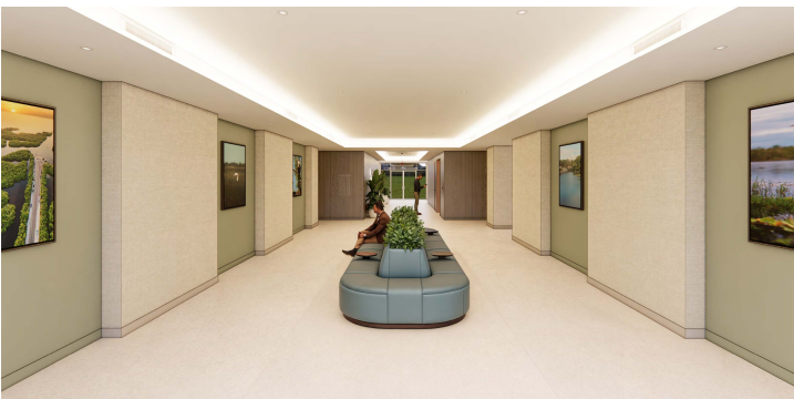
LOBBY RENDERING - FRONT ENTRANCE