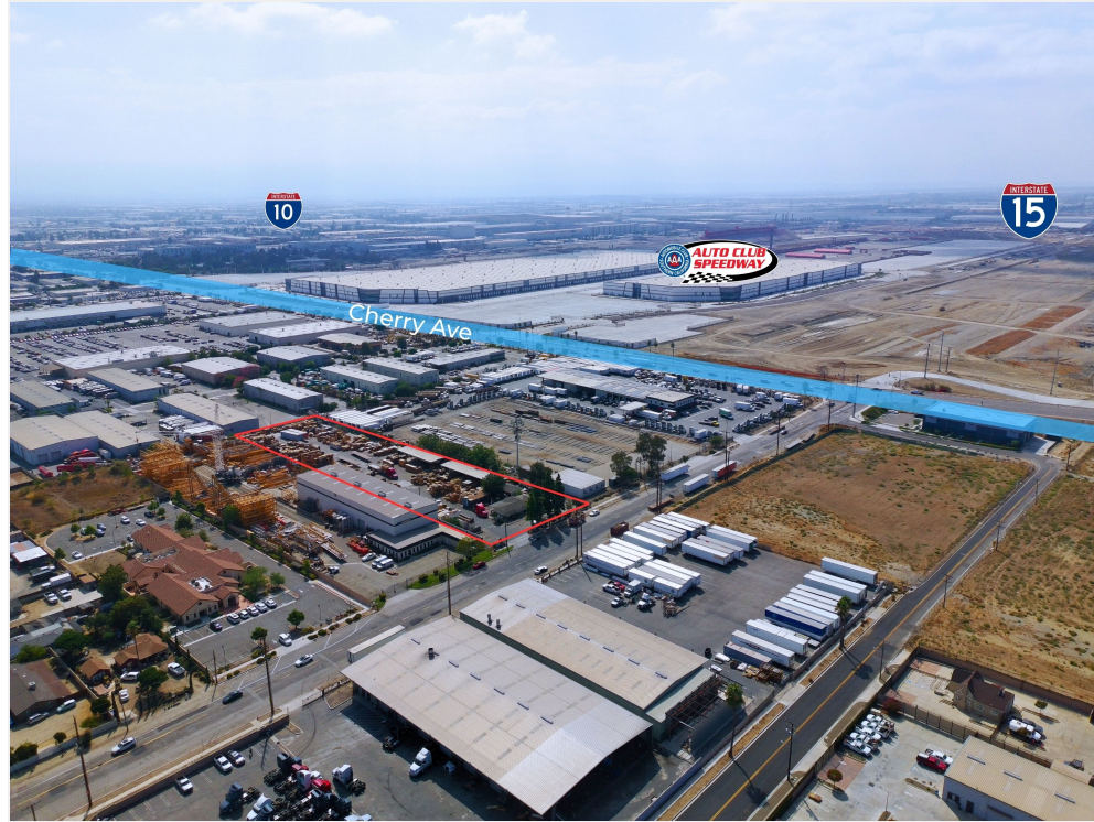
Cherry and Merrill