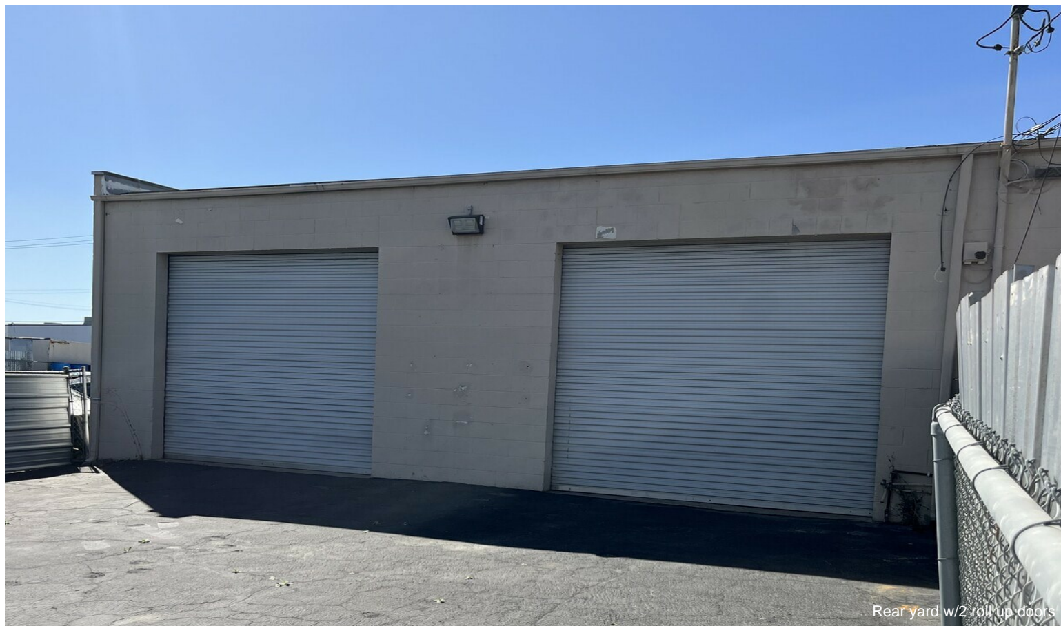
Rear yard w/2 roll up doors