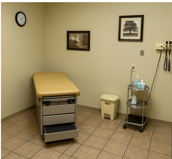
TYPICAL EXAM ROOM