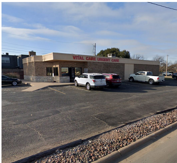
FRONT / SIDE ELEVATION