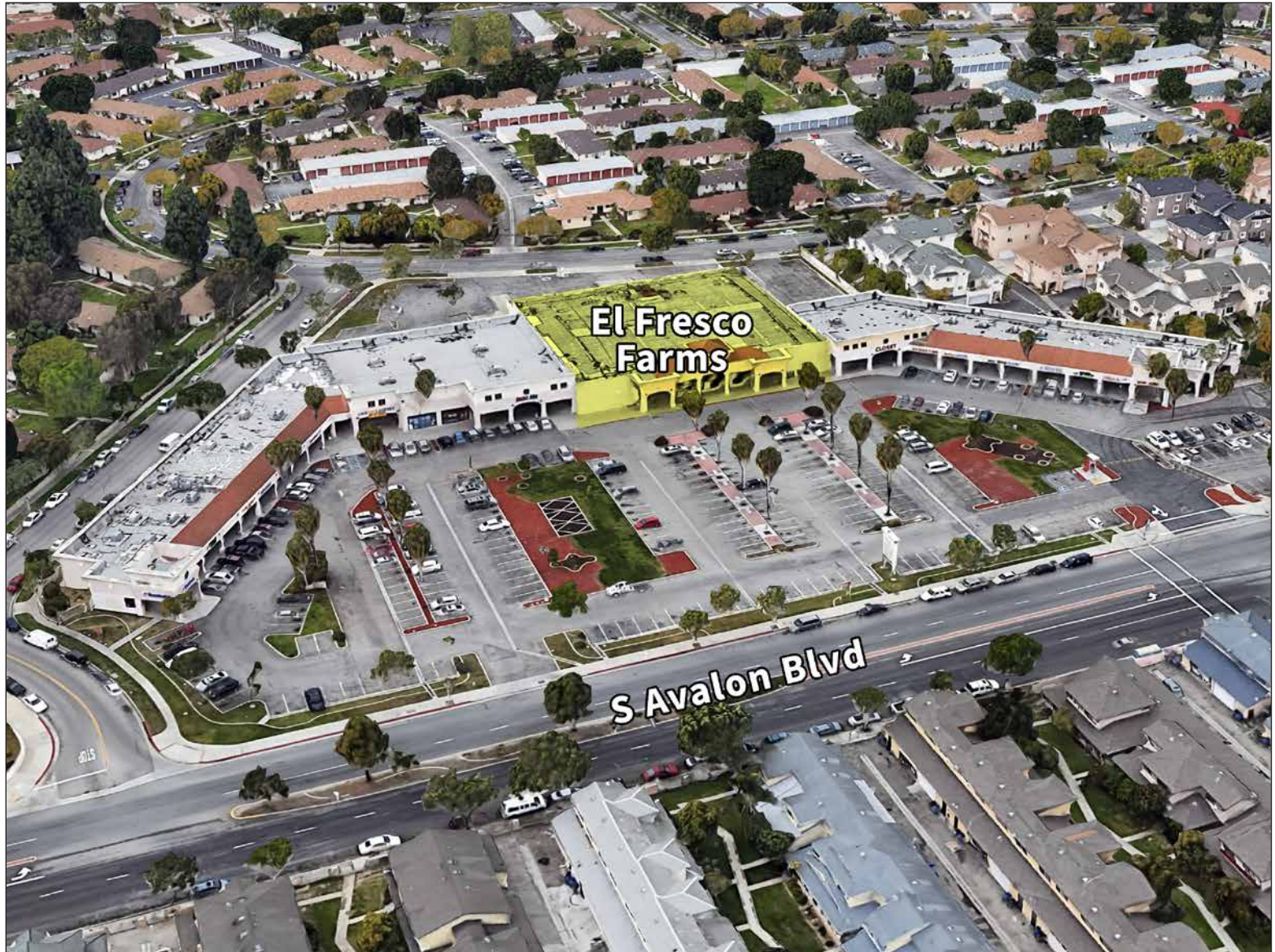
Avalon Plaza Neighborhood Center