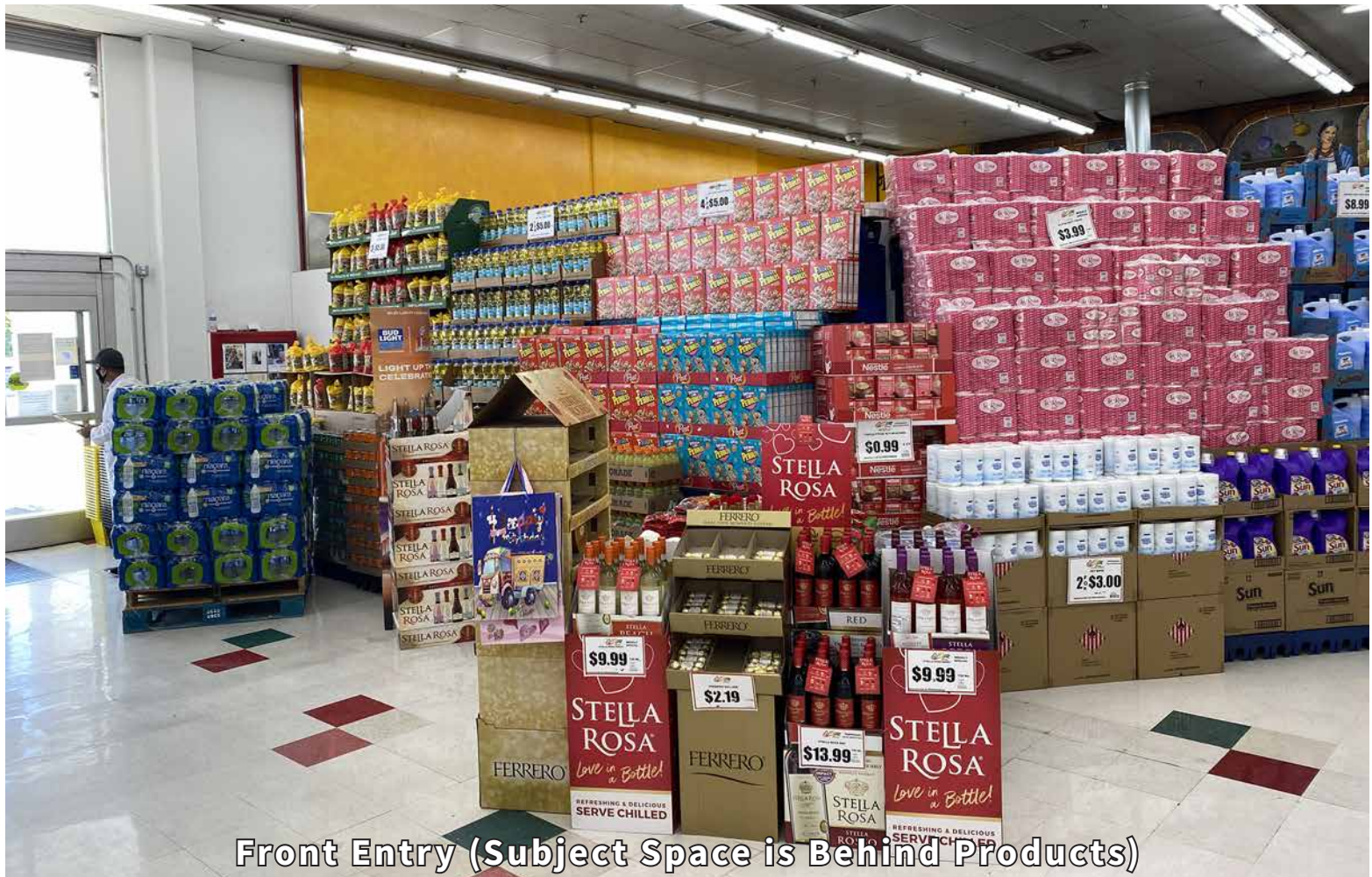
Front Entry (Subject Space is Behind Products)