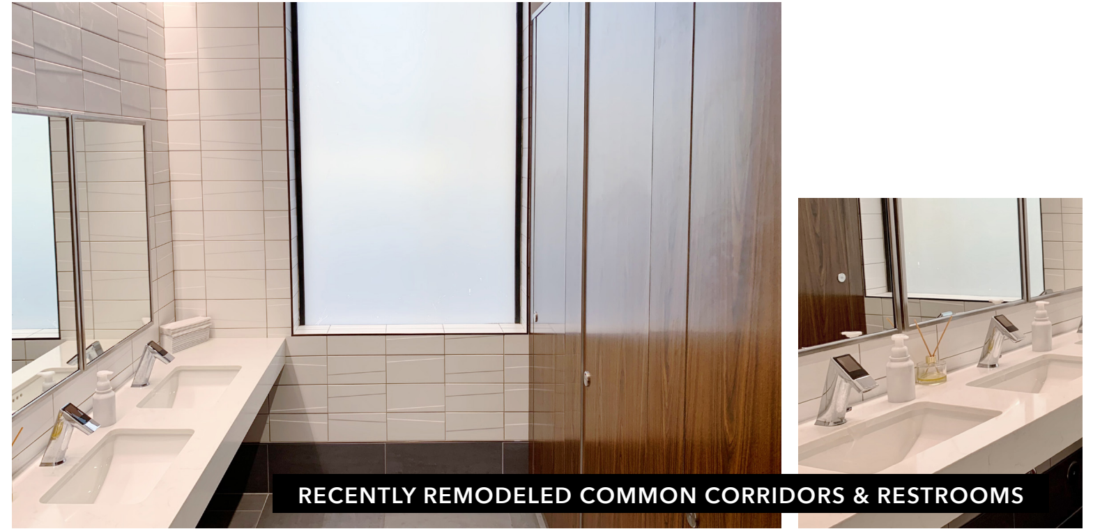
RECENTLY REMODELED COMMON CORRIDORS & RESTROOMS