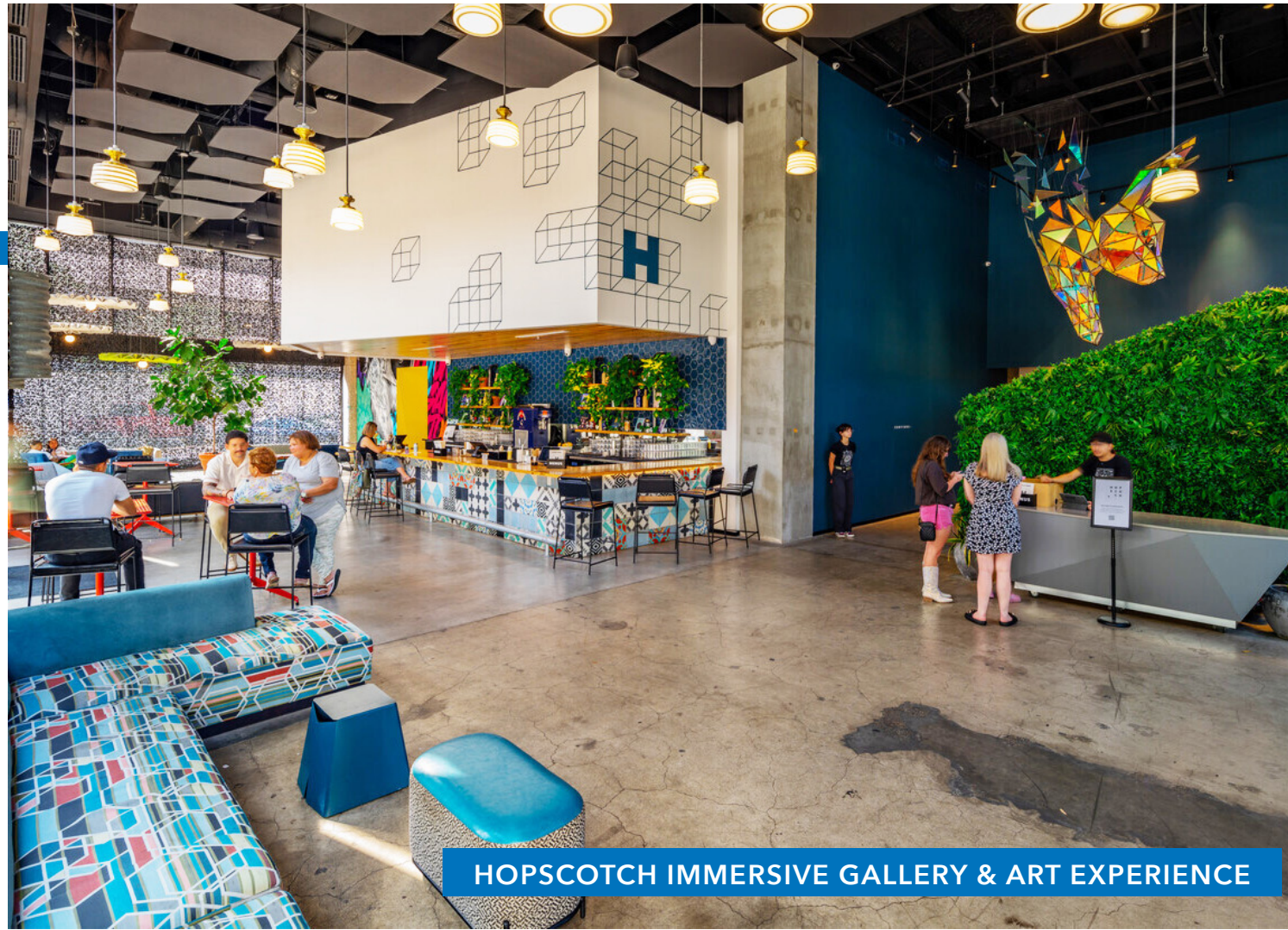
HOPSCOTCH IMMERSIVE GALLERY & ART EXPERIENCE