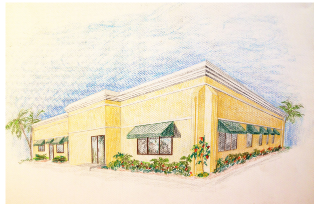
New outparcel facade look.