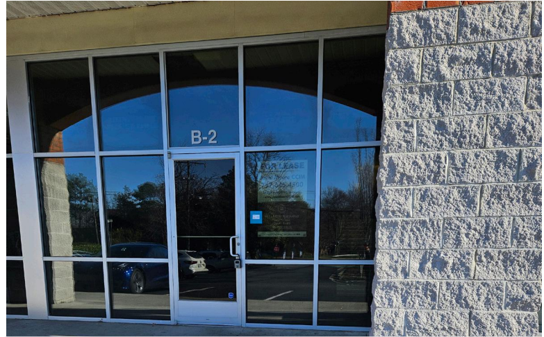
Former Hair Salon