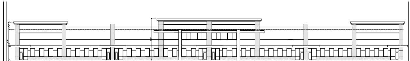
1 BUILDING 100 PRELIMINARY FLOOR PLAN SCALE: 3/16" = 1'-0"