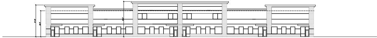
2 BUILDING 200 PRELIMINARY FLOOR PLAN SCALE: 3/16" = 1'-0"