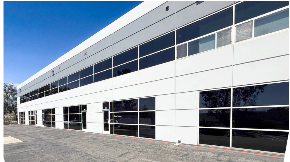
BACK OF UNIT