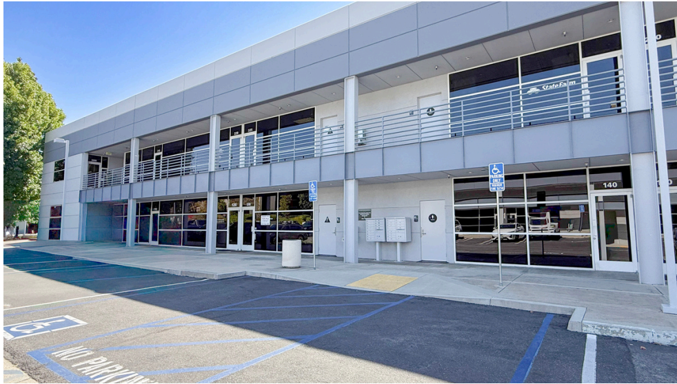
FRONT OF UNIT