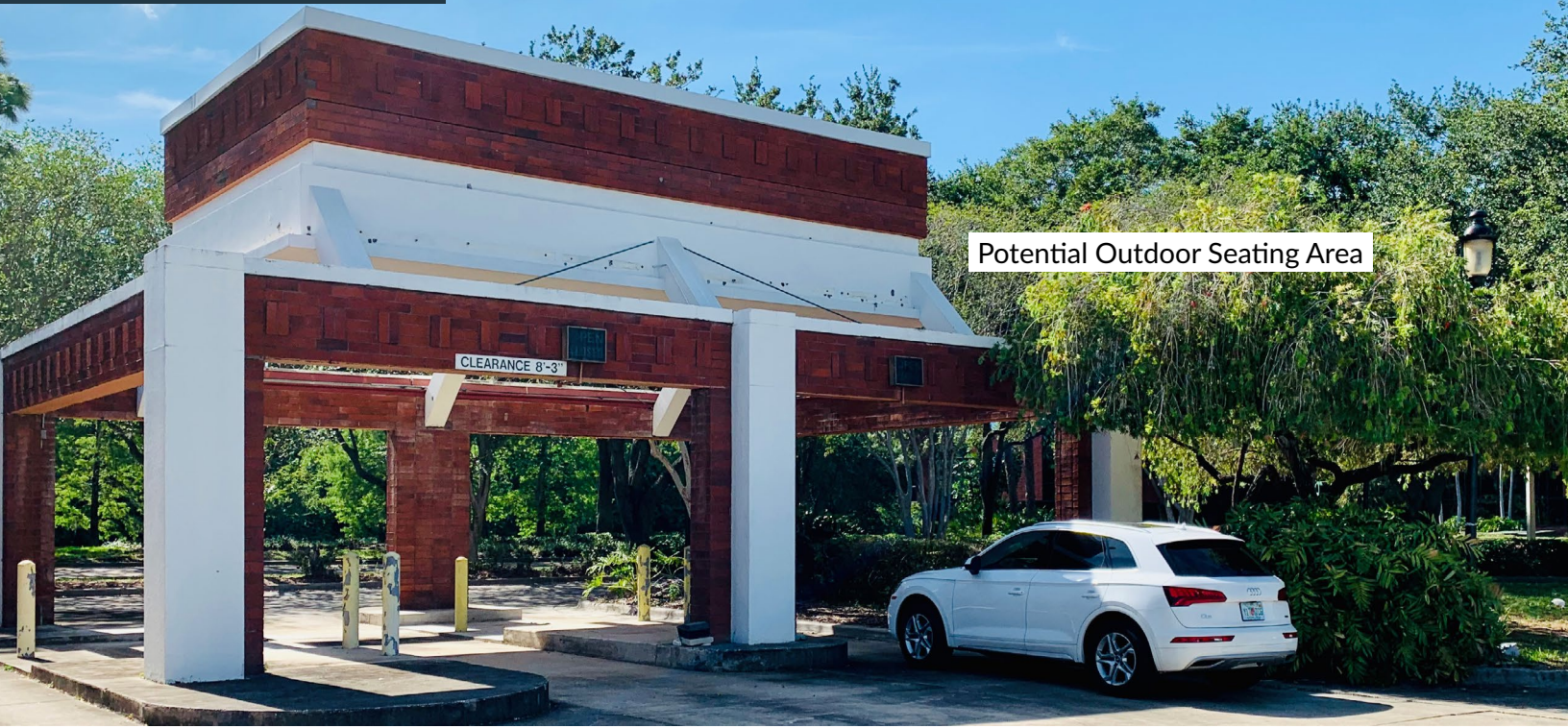
Potential Outdoor Seating Area

5501-5545 Roosevelt Blvd., Clearwater, FL 33760