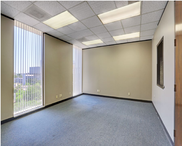
sample office suite