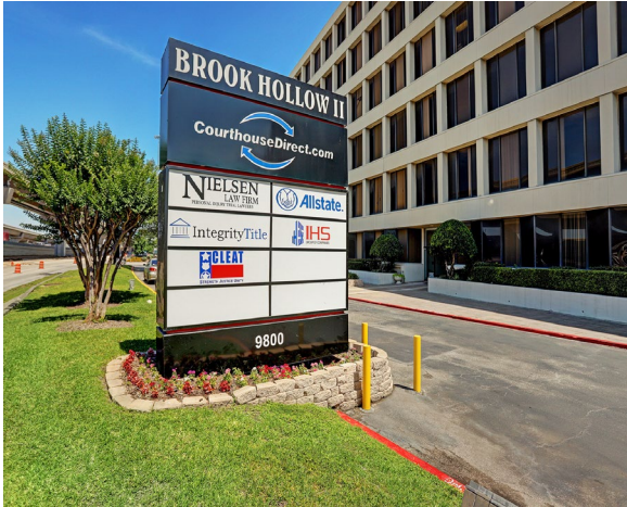
tenant signage opportunity