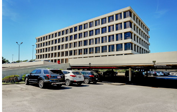
abundant parking options