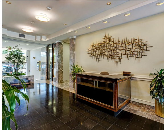
welcoming lobby w/ building concierge