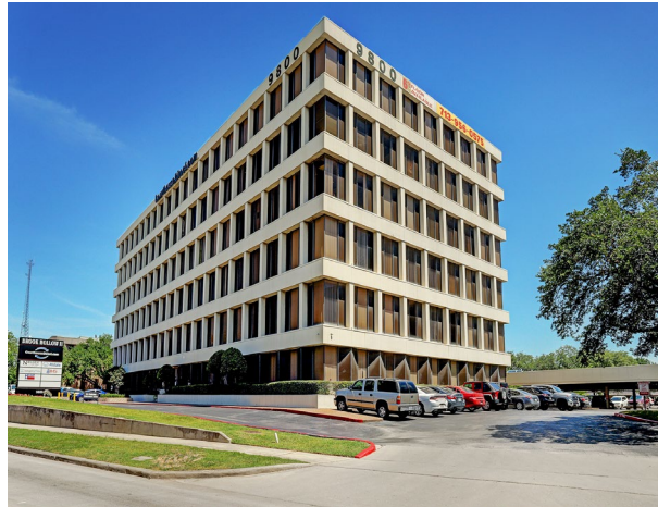
impressive exterior presence