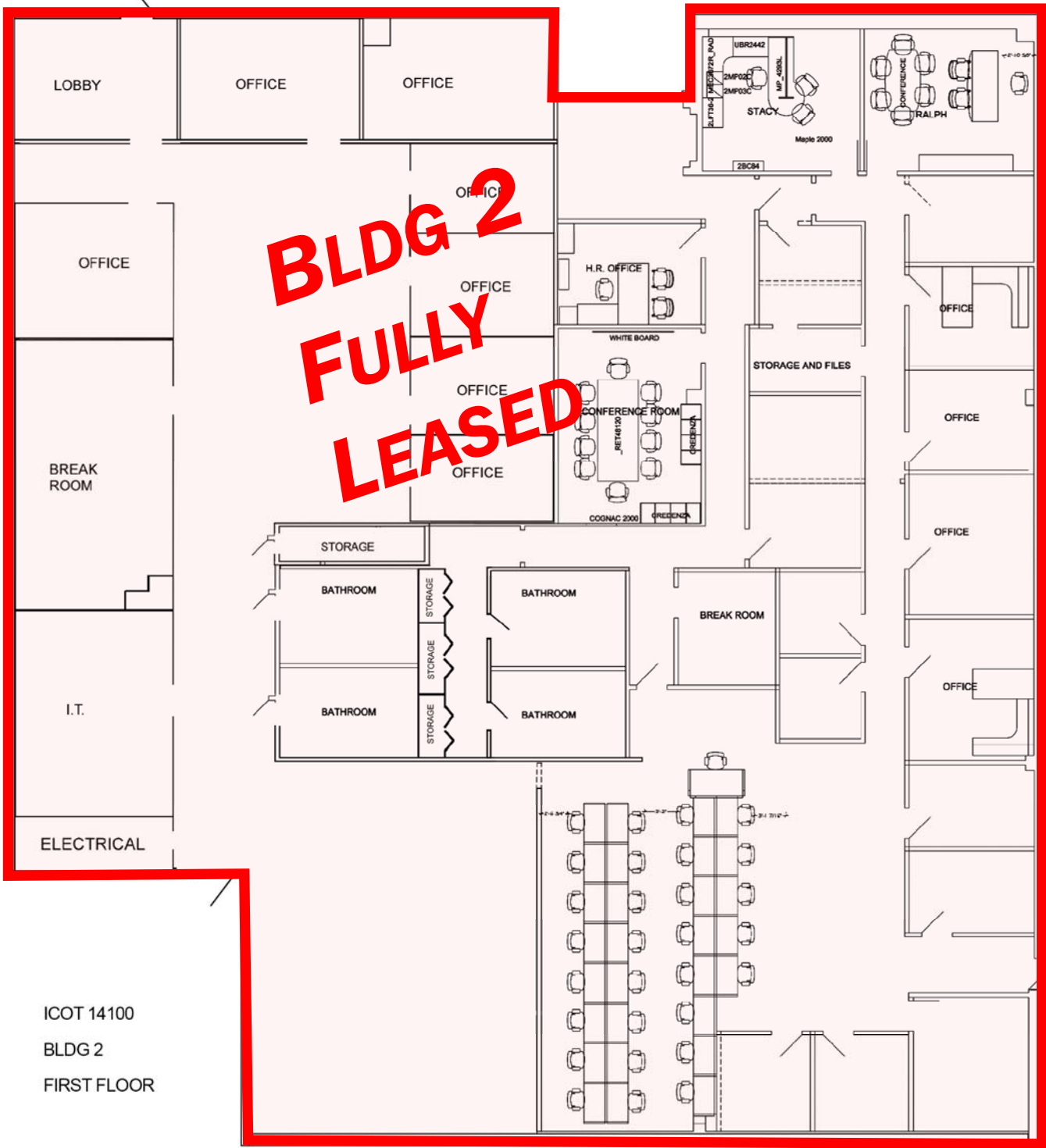
ICOT 14100 BLDG 2 FIRST FLOOR