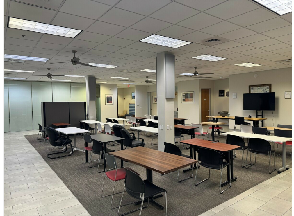
Suite 101 Center of office space