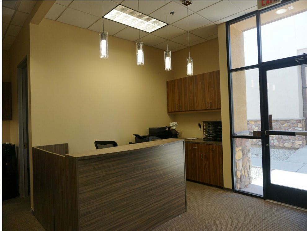
Reception Suite 103