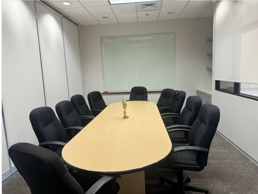
Suite 101 Conference Room