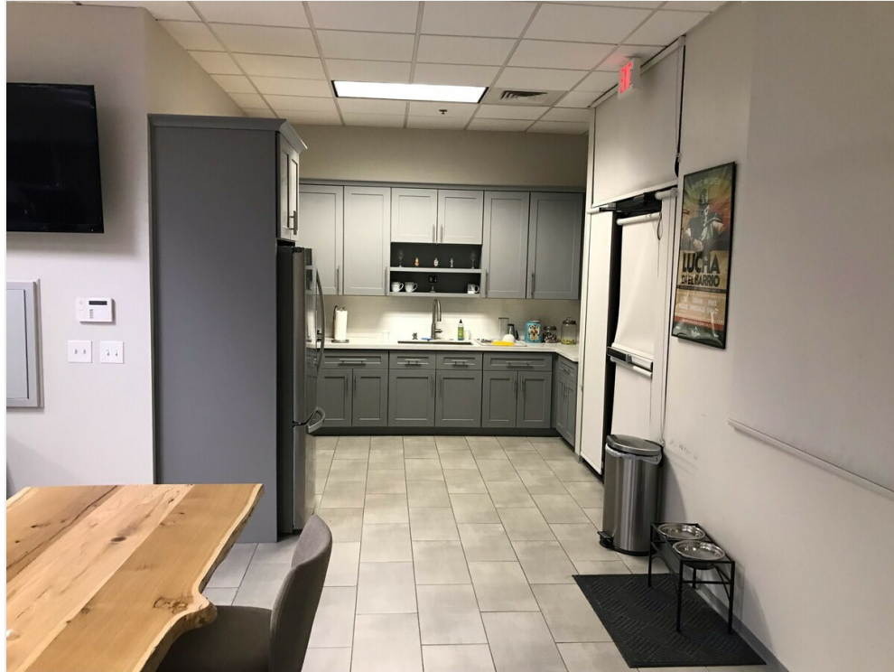
Long view of break room and rear exit door of Suite 101