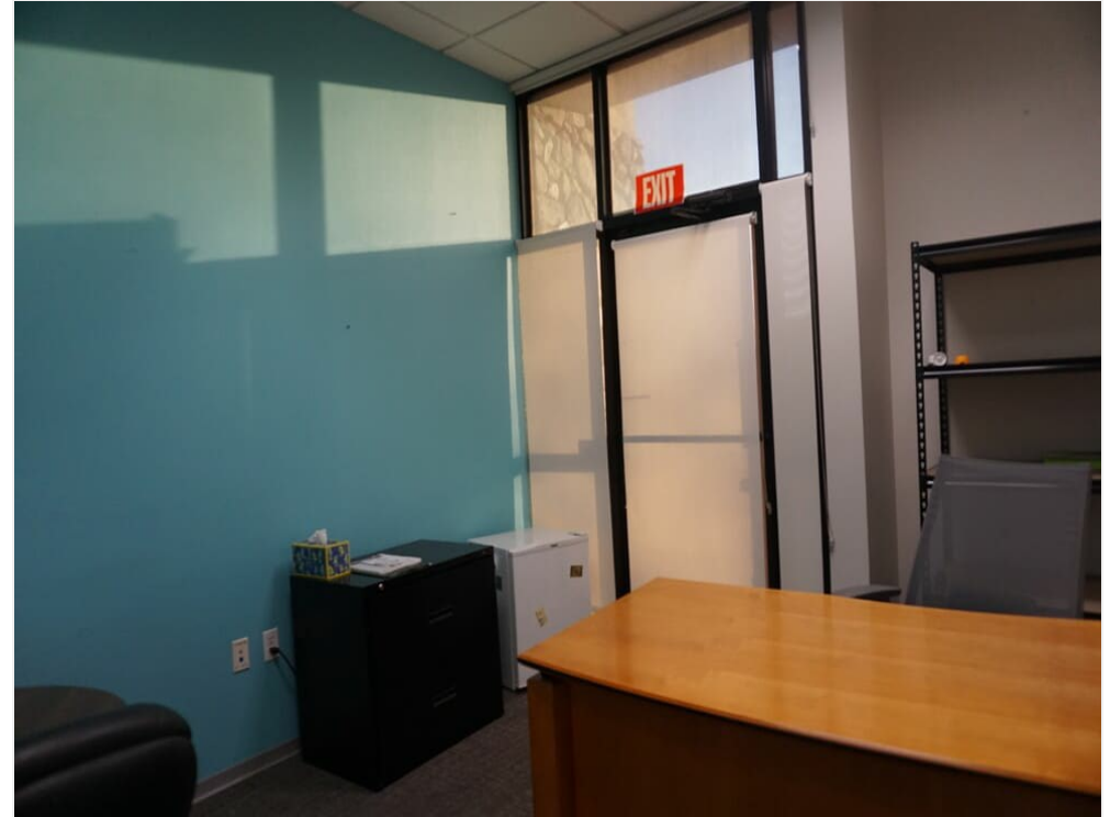
Suite 102 office with exterior door.