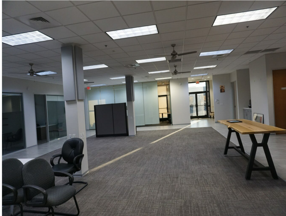
Suite 101 center space