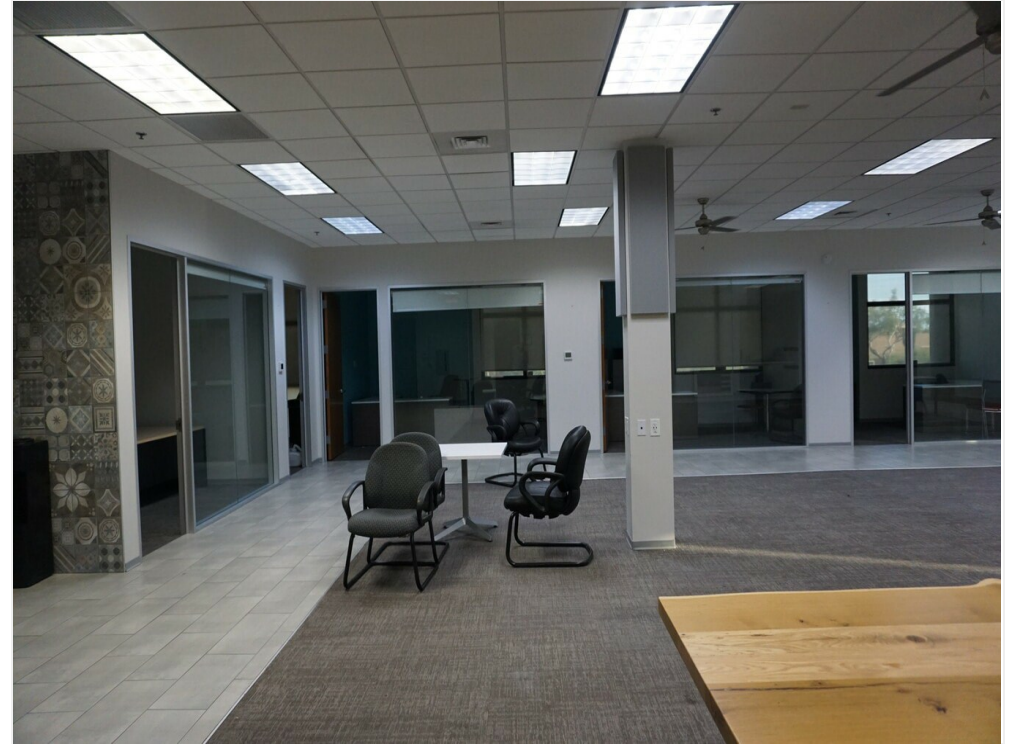
Suite 101 view from back of main room