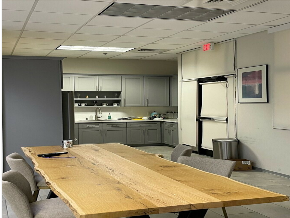
Break room view from table in Suite 101