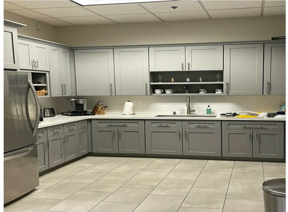
Full view of break room kitchen in Suite 101