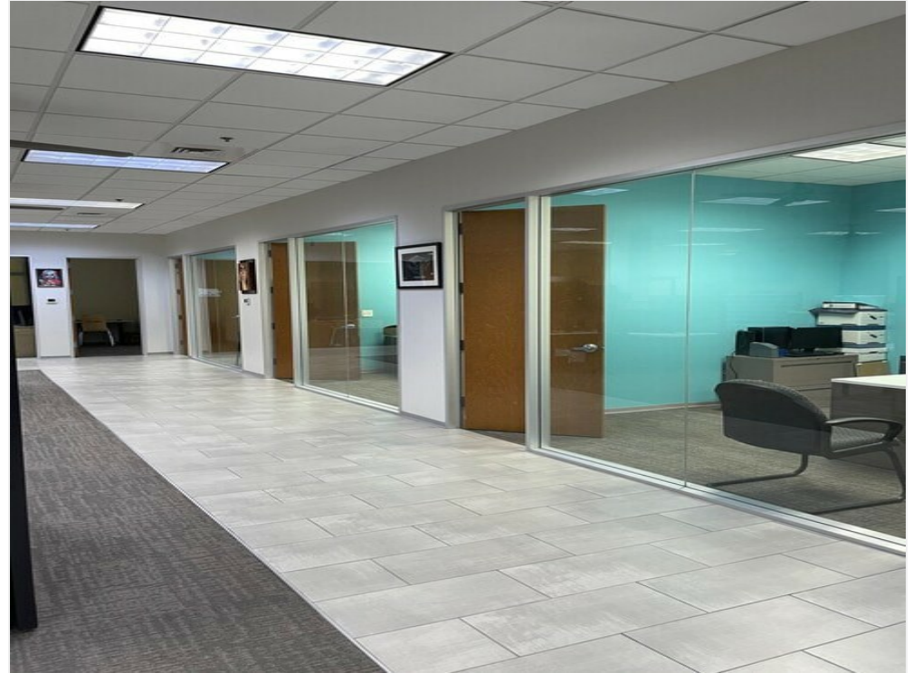
Suite 101 row offices