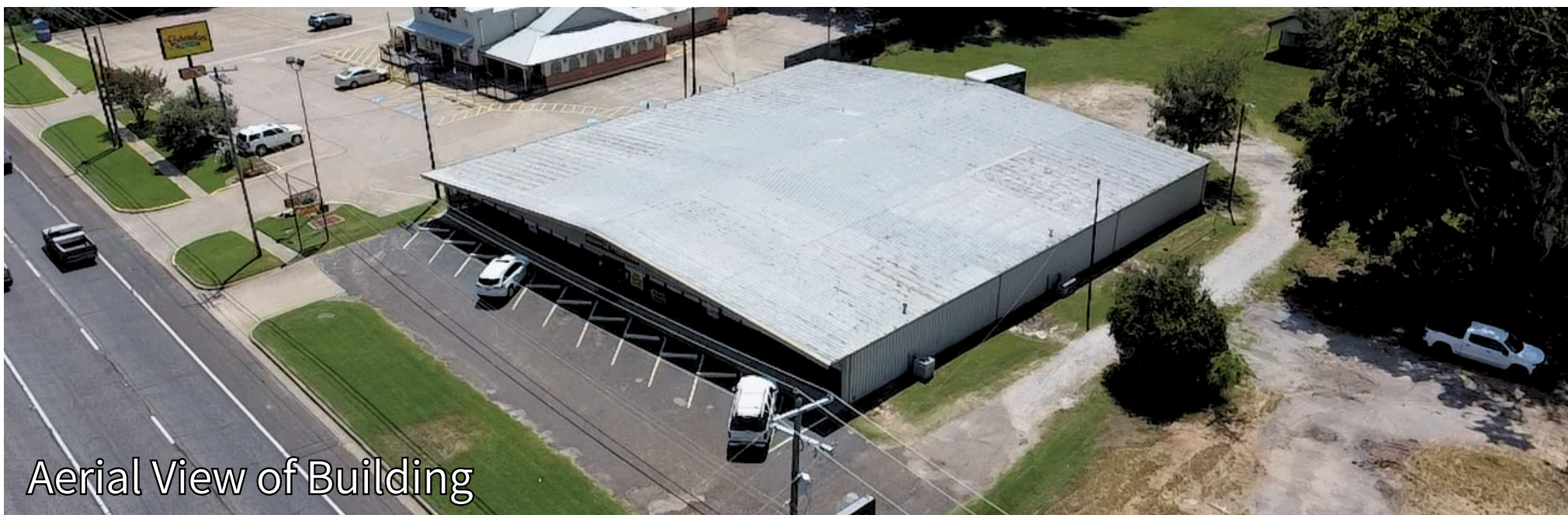
Aerial View of Building