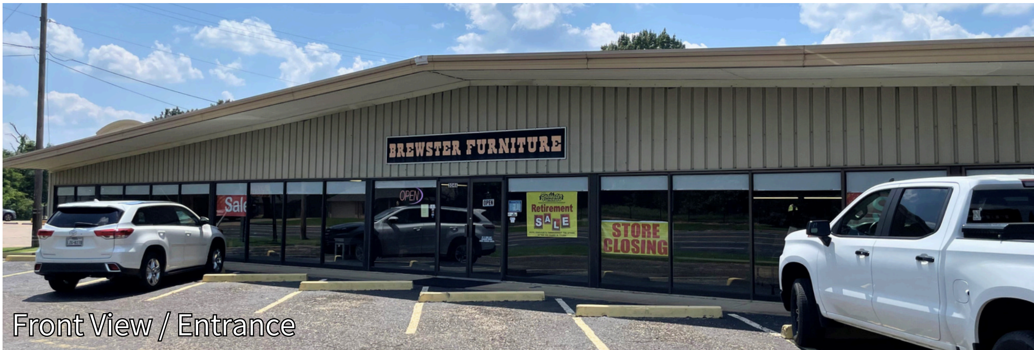
Front View / Entrance