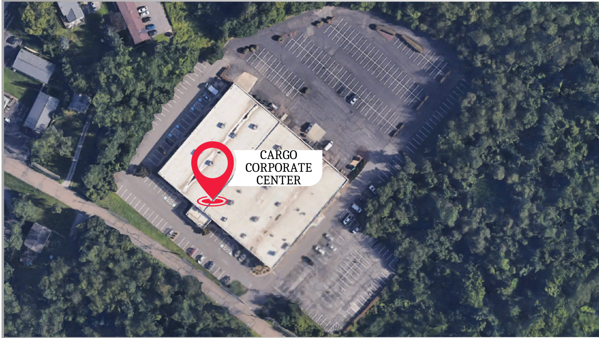
CARGO CORPORATE CENTER

BAKER YOUNG CORPORATION | 7440 McKnight Road | Suite 202 | Pittsburgh, PA 15237