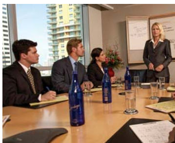
Meeting rooms that fit your needs.