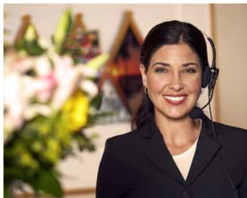
A receptionist to greet your visitors.