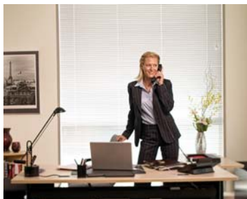
Fully equipped offices On-Demand.