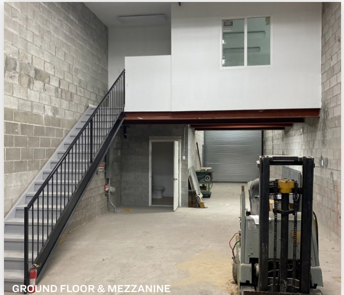
GROUND FLOOR & MEZZANINE