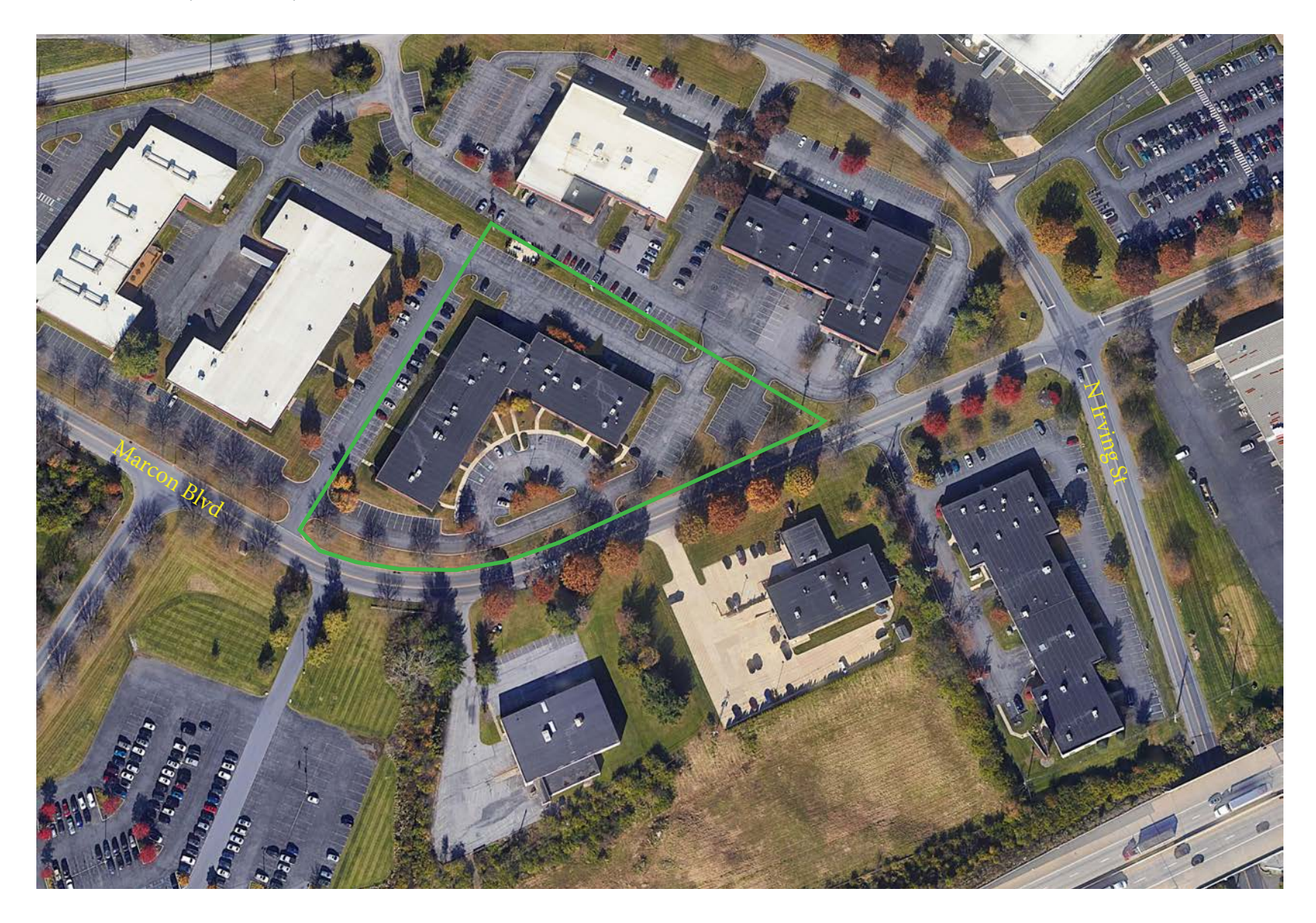
© 2025 CBRE, Inc. All rights reserved. This information has been obtained from sources believed reliable, but has not been verified for accuracy or completeness. You should conduct a careful, independent investigation of the property and verify all information. Any reliance on this information is solely at your own risk. CBRE and the CBRE logo are service marks of CBRE, Inc. All other marks displayed on this document are the property of their respective owners, and the use of such logos does not imply any affiliation with or endorsement of CBRE. Photos herein are the property of their respective owners. Use of these images without the express written consent of the owner is prohibited.