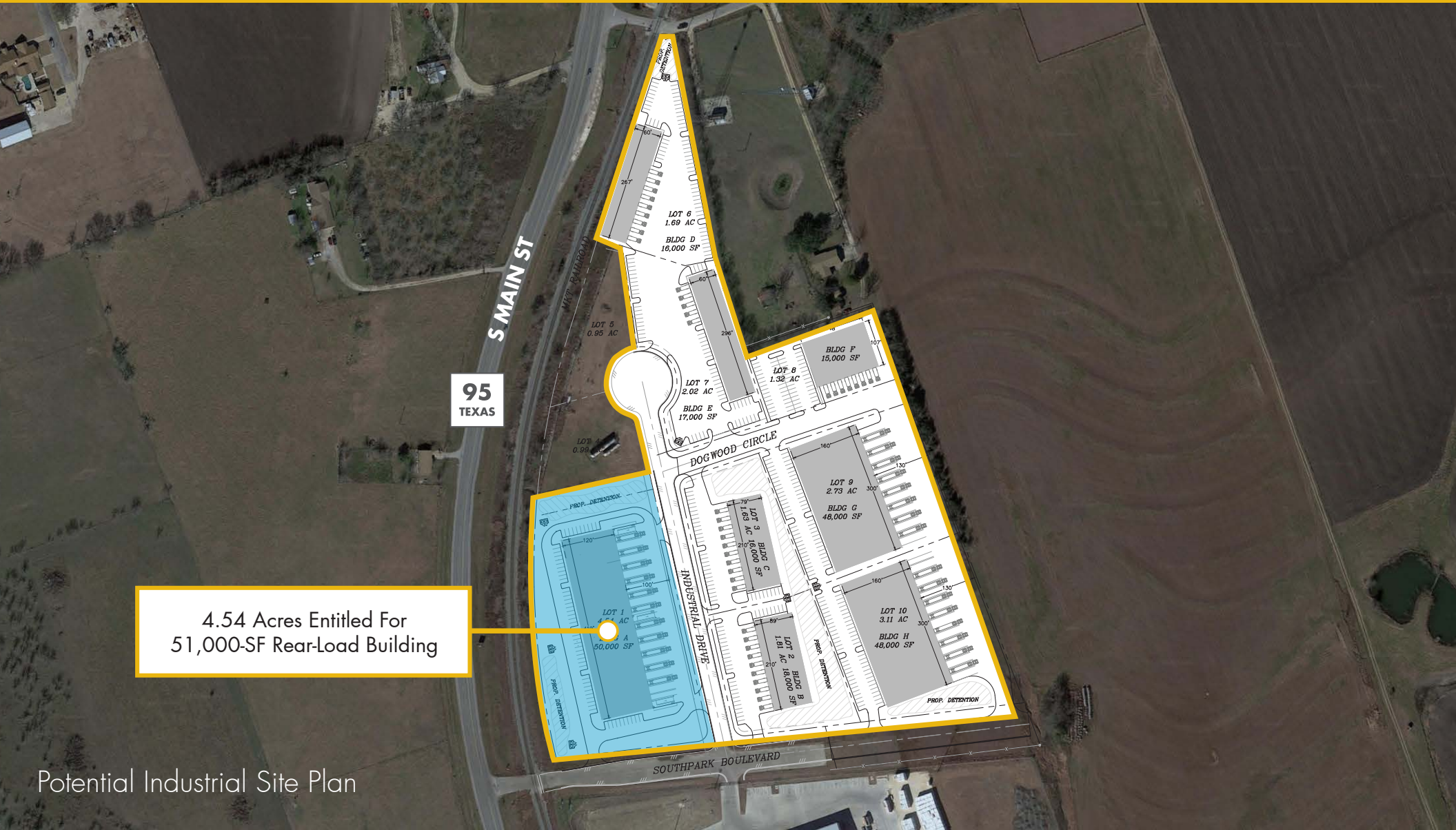
Potential Industrial Site Plan