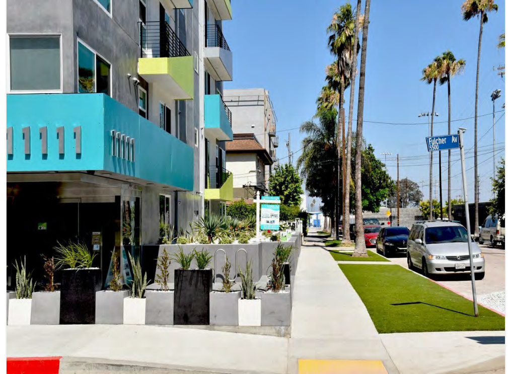
11111-cumpston-st 2nd photo