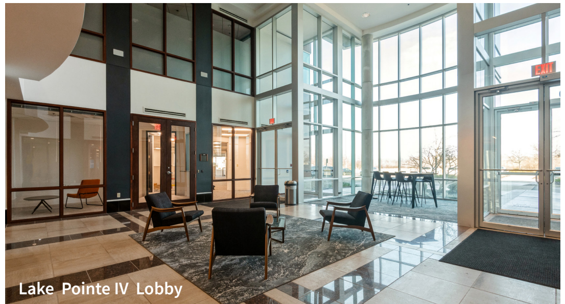
Lake Pointe IV Lobby