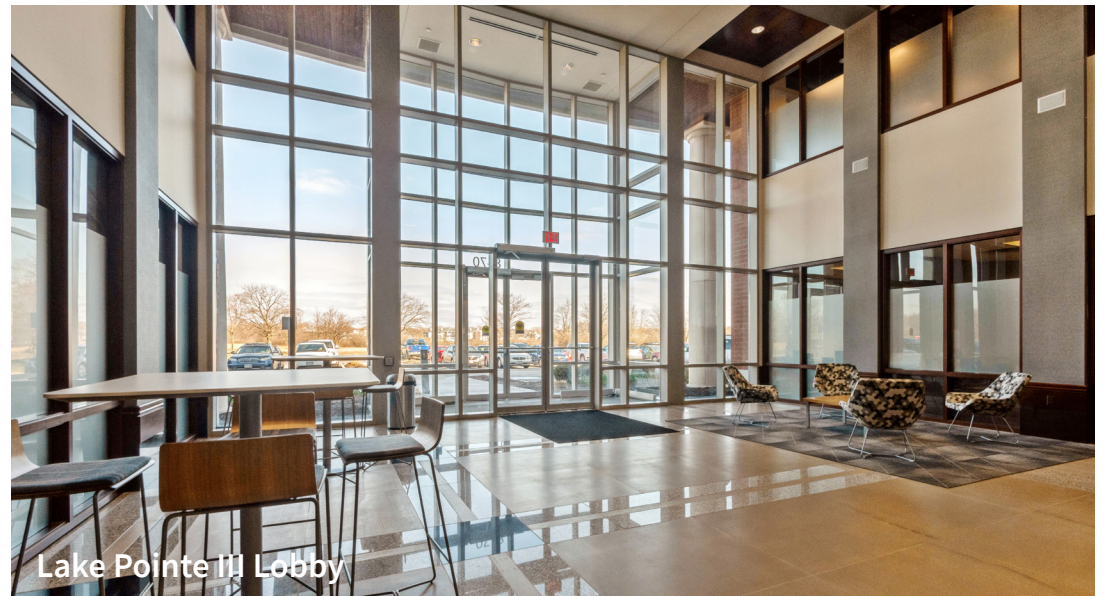
Lake Pointe III Lobby