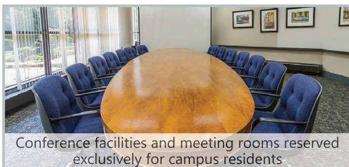
Conference facilities and meeting rooms reserved exclusively for campus residents