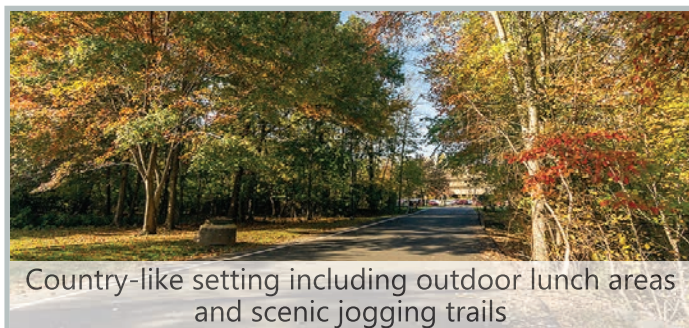
Country-like setting including outdoor lunch areas and scenic jogging trails