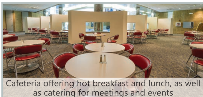
Cafeteria offering hot breakfast and lunch, as well as catering for meetings and events