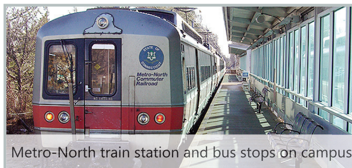
Metro-North train station and bus stops on campus