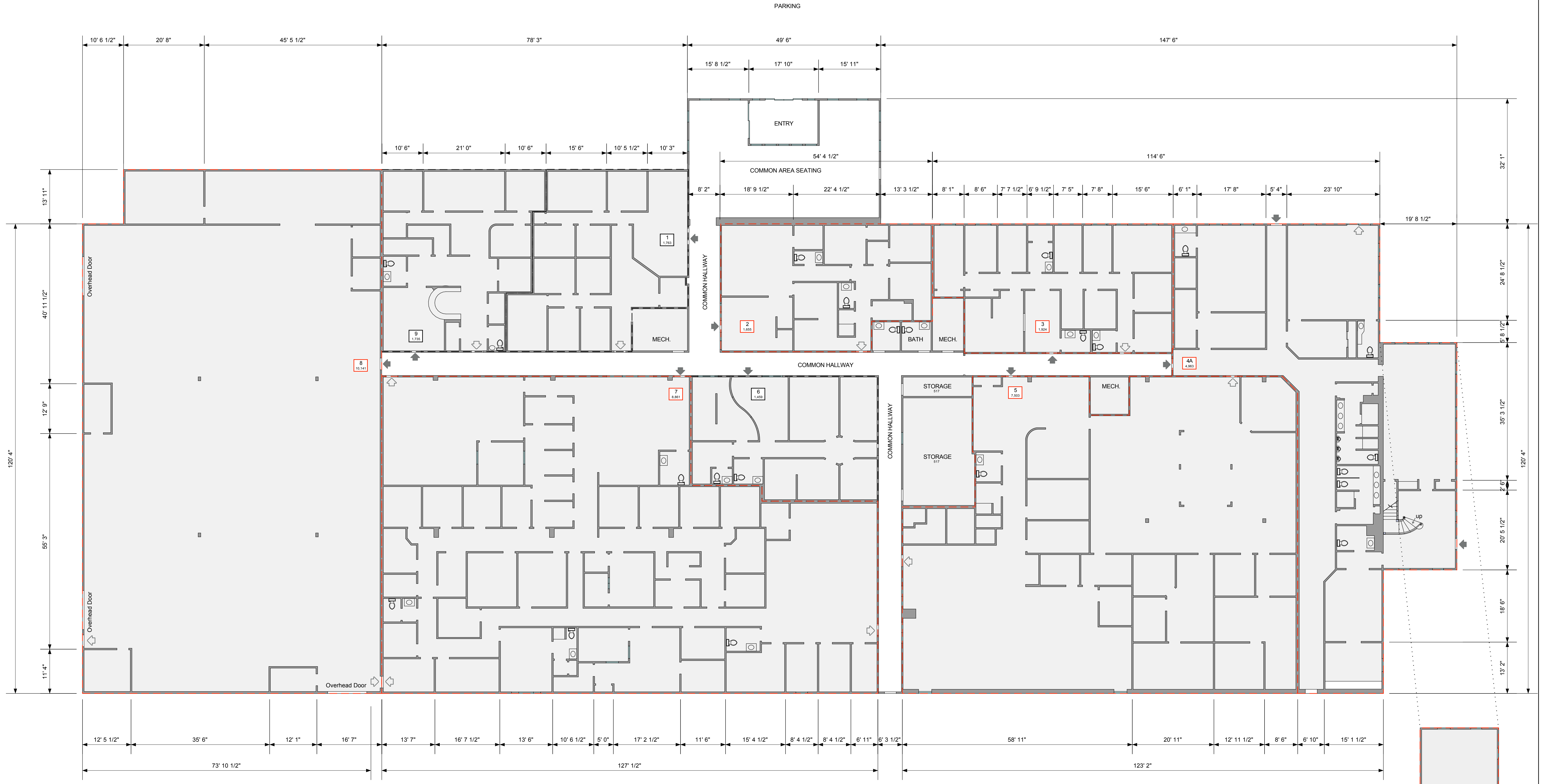
A EXISTING FIRST FLOOR PLAN 011 scale: as noted