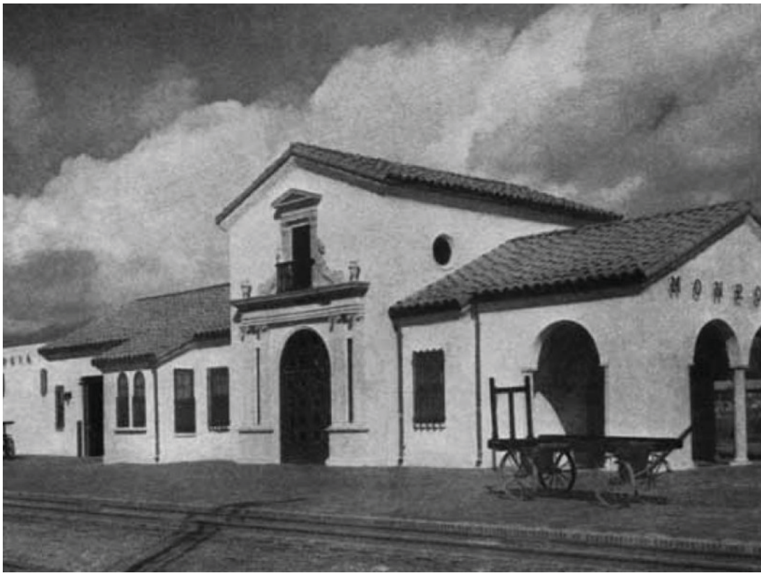
R E S T O R A T I O N