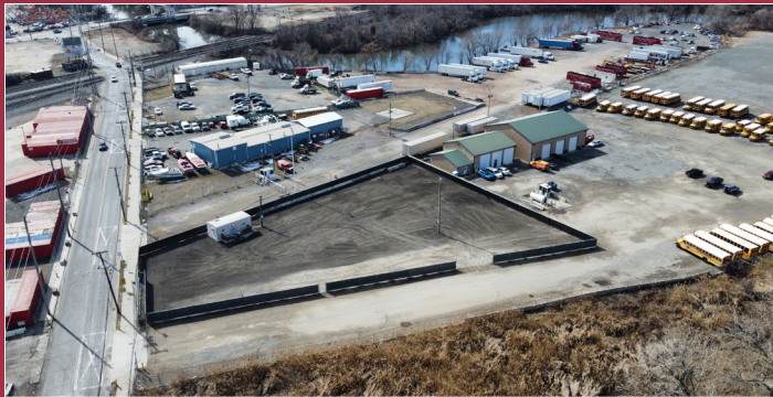
EXAMPLE OF DEMISED PREMISES LOT