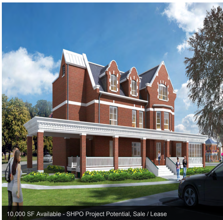
10,000 SF Available - SHPO Project Potential, Sale / Lease