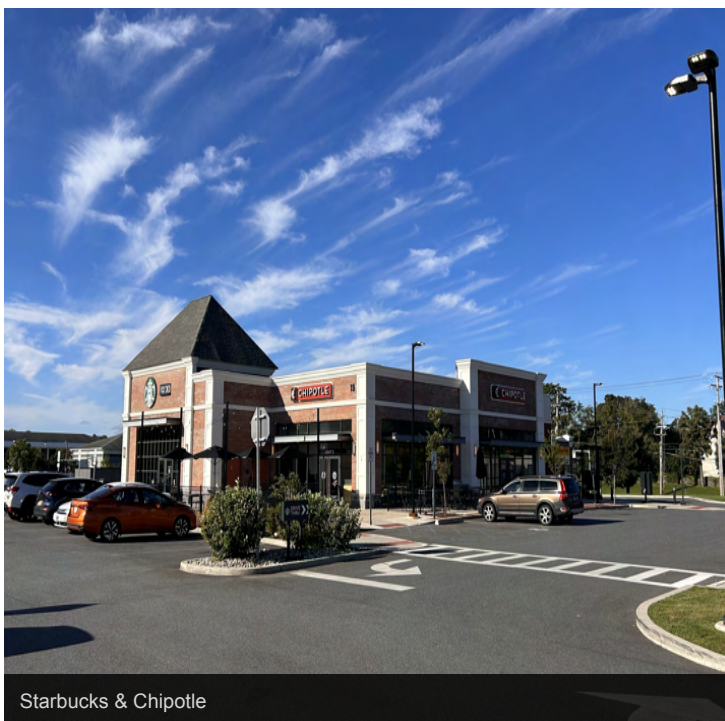
Starbucks & Chipotle