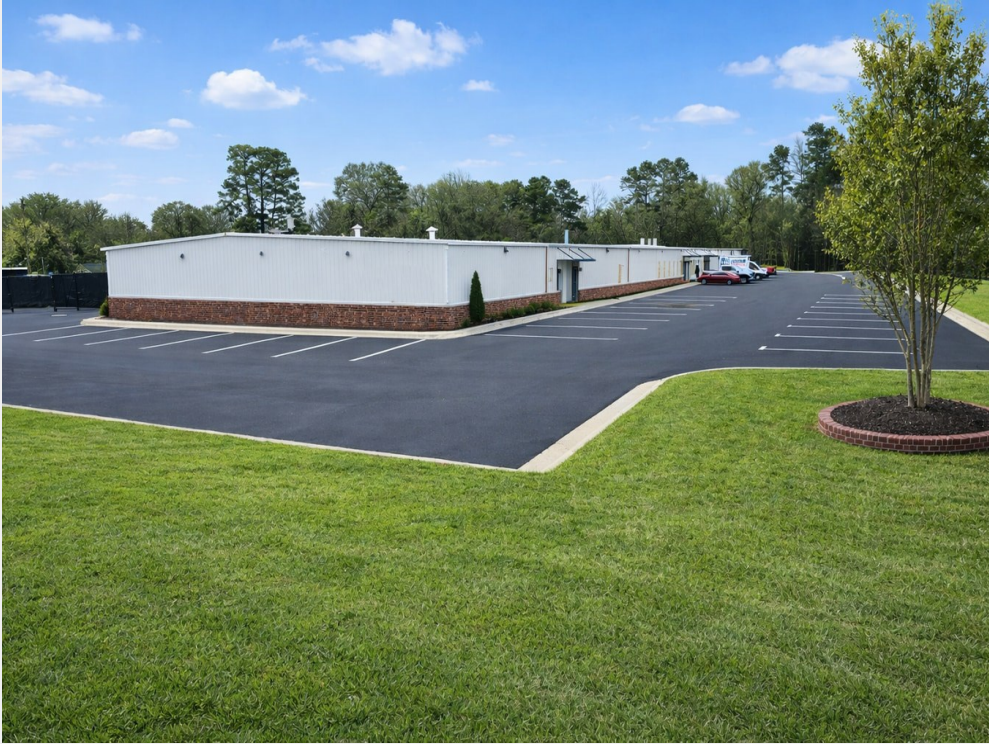
Premier Industrial and Flex Facility