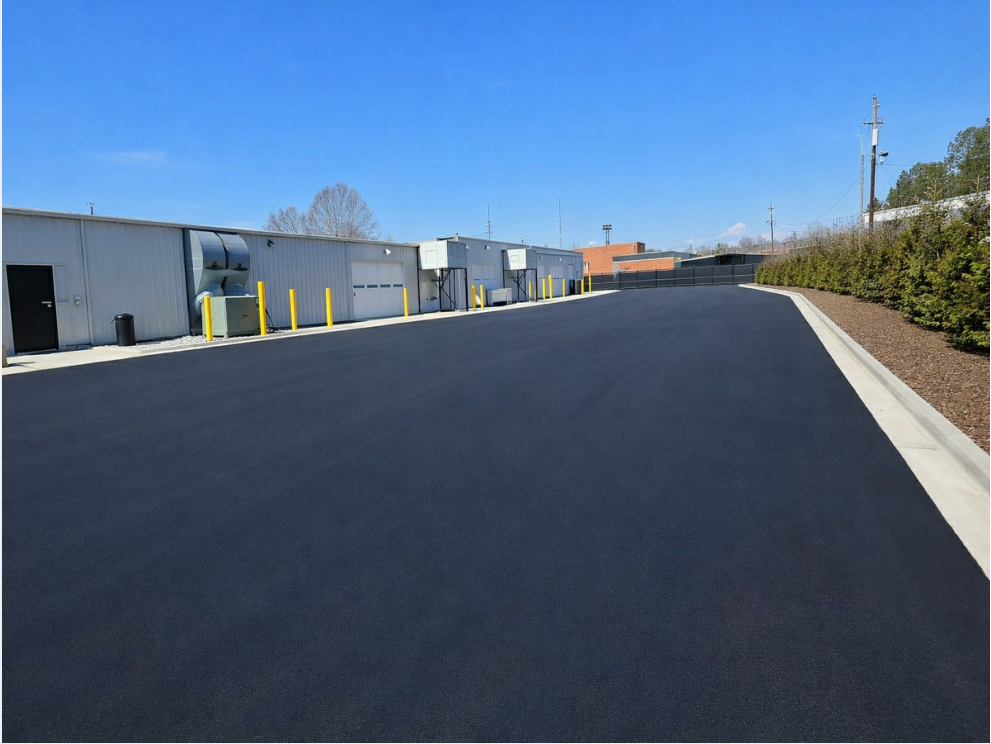
Parking or Secured Outdoor Storage Yard