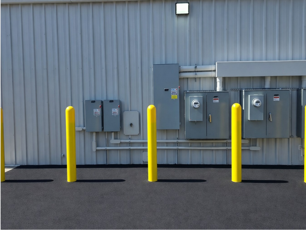
Heavy Power Capabilities