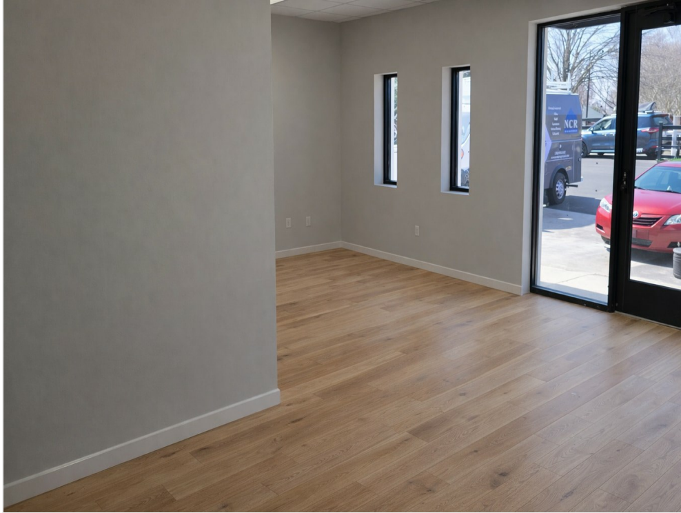
Office (3,363 Sq Ft)