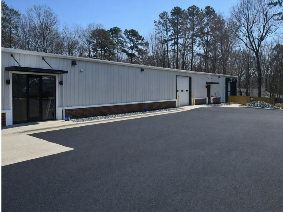
6 total dock and drive in doors