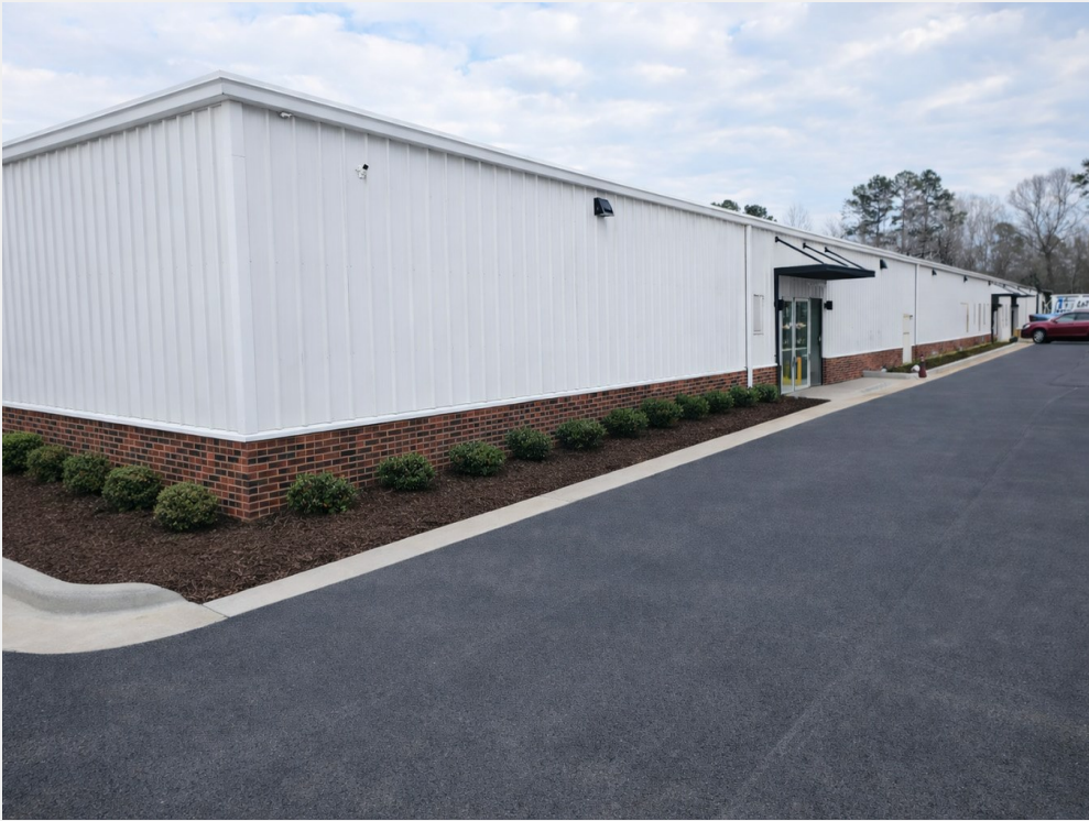
Well-Constructed and Maintained Asset