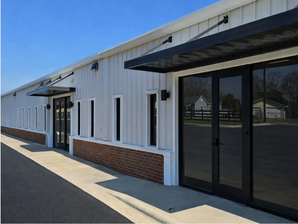
3 storefront glass entries