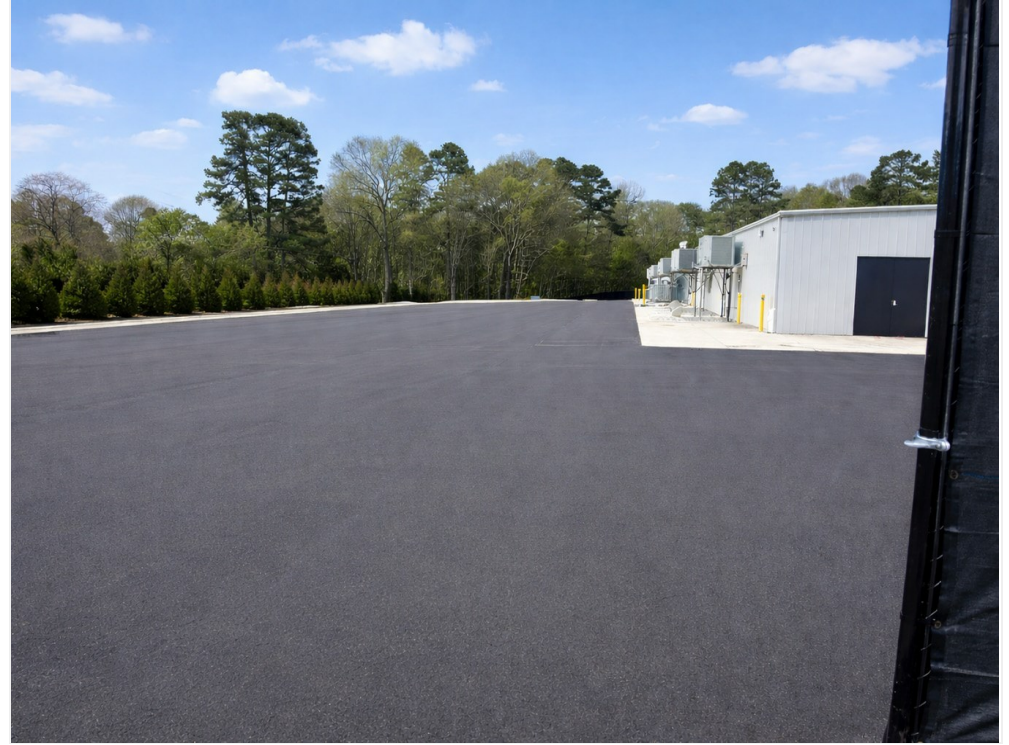
Plenty of Outdoor Space for Vehicles