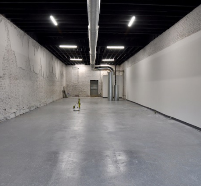
Interior - front to the rear