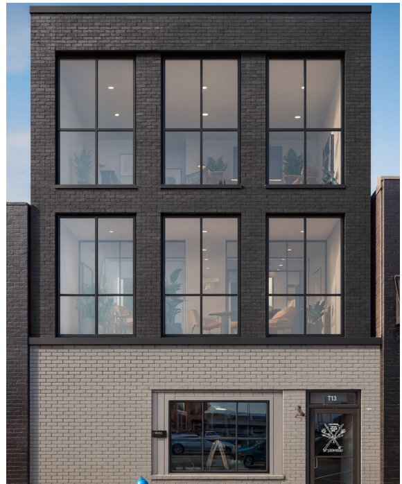
Potential second and/or third story possible