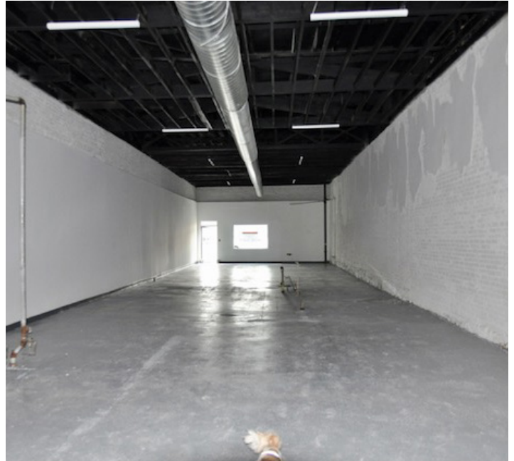
Interior - rear looking to the front