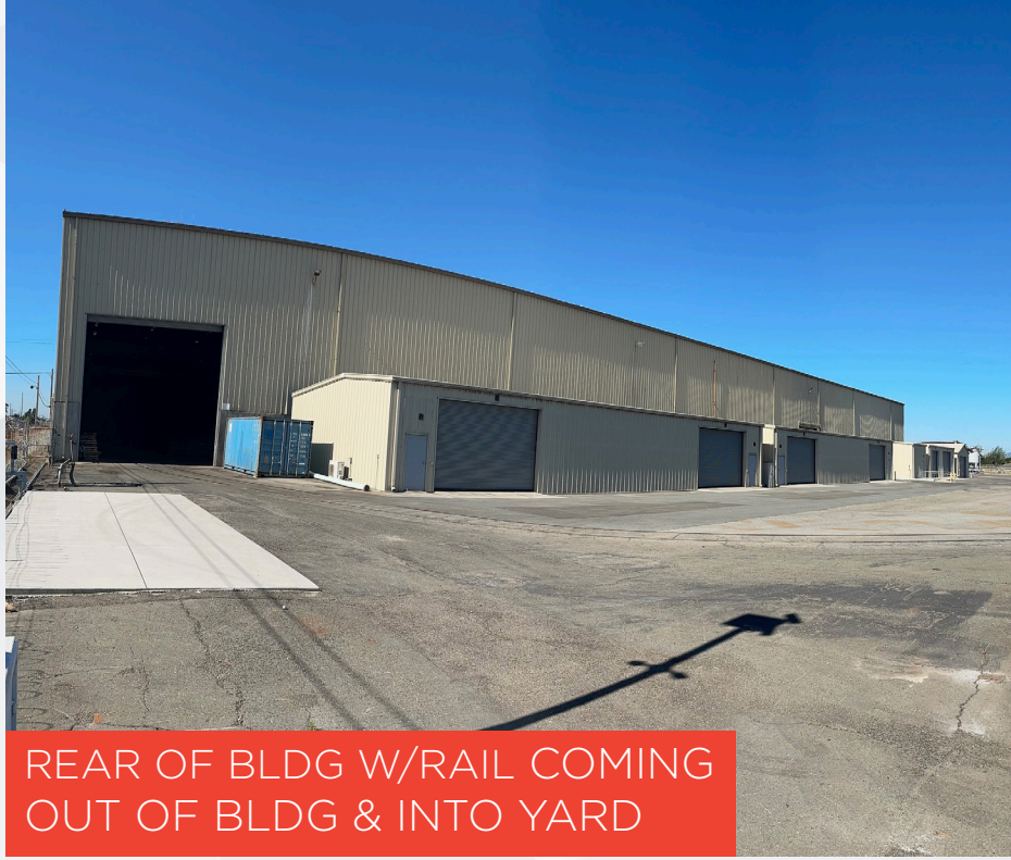
REAR OF BLDG W/RAIL COMING OUT OF BLDG & INTO YARD