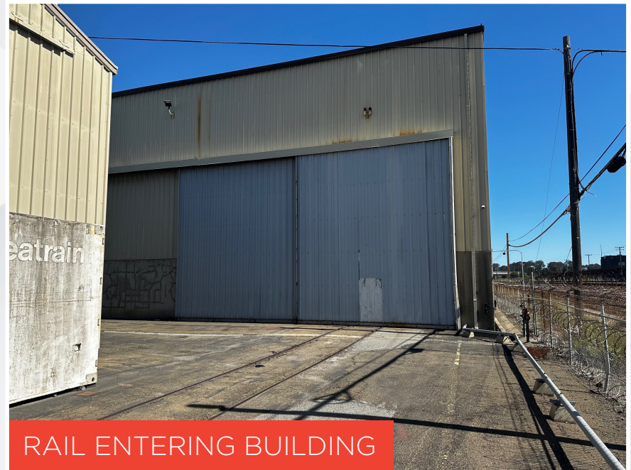
RAIL ENTERING BUILDING