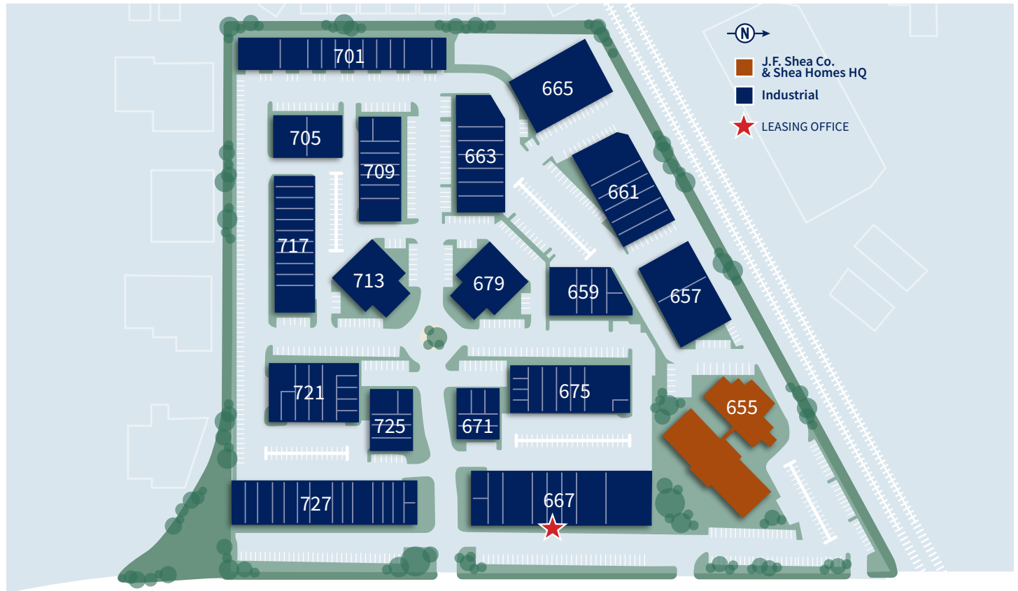
BREA CANYON RD.