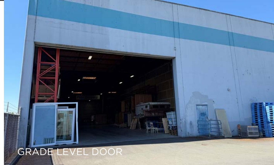
GRADE LEVEL DOOR