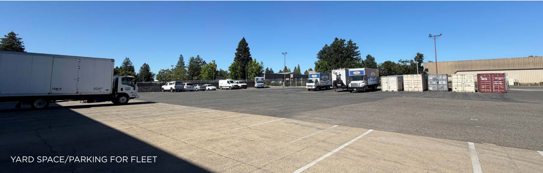
YARD SPACE/PARKING FOR FLEET