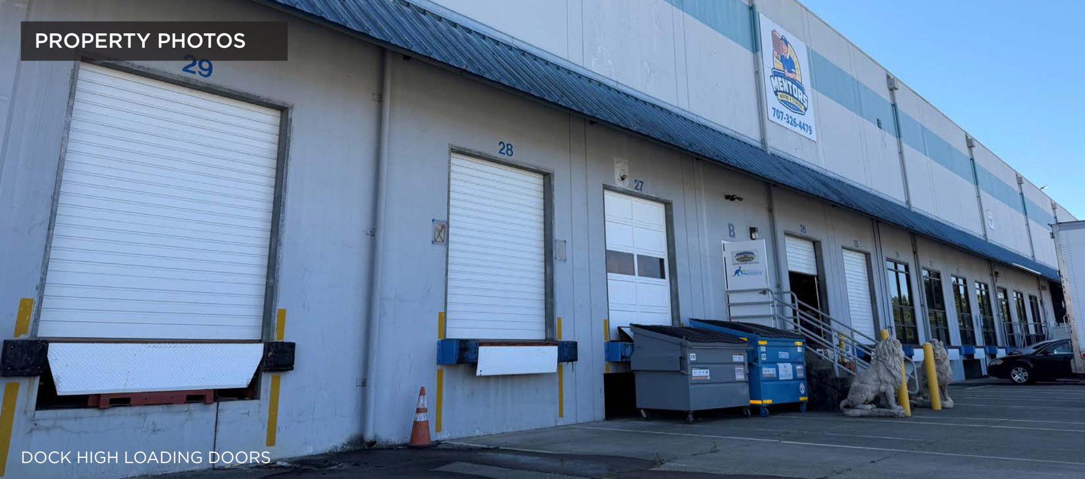
DOCK HIGH LOADING DOORS