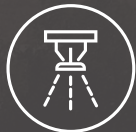
High Pile Sprinkler System