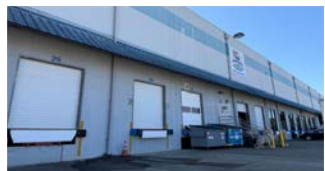
3000 DUTTON AVE