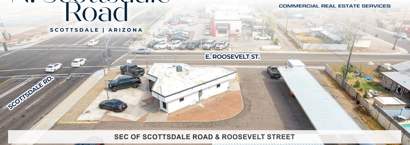
SEC OF SCOTTSDALE ROAD & ROOSEVELT STREET