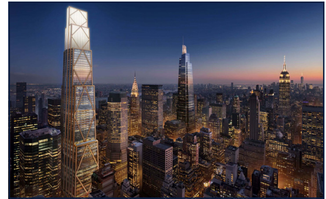
JP MORGAN CHASE & CO.