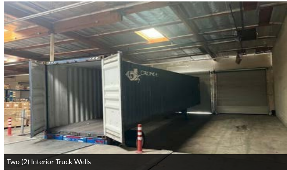
Two (2) Interior Truck Wells