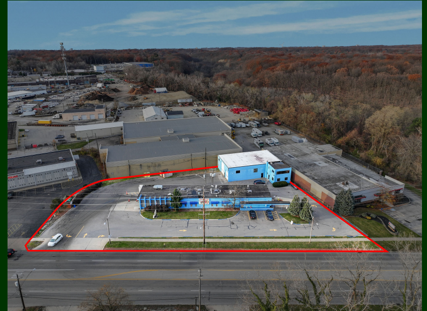
4325 & 4345 Monticello Blvd., South Euclid, OH 44121

No warranty or representation, express or implied, is made as to the accuracy of the information contained herein. It is submitted subject to errors, omissions, price changes, rental or other conditions, withdrawal without notice, and to any special listing conditions imposed by our client.