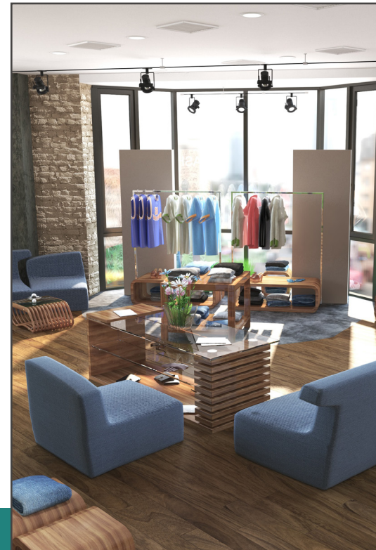
RENDERING OF SPACE FOR LEASE*

CURRENTLY UNDER CONSTRUCTION EST. COMPLETION: JANUARY 2025