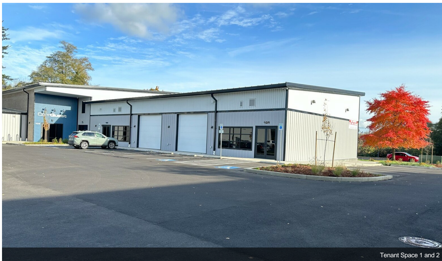
Tenant Space 1 and 2