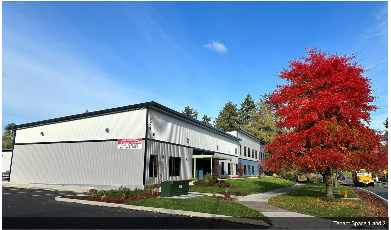
Tenant Space 1 and 2