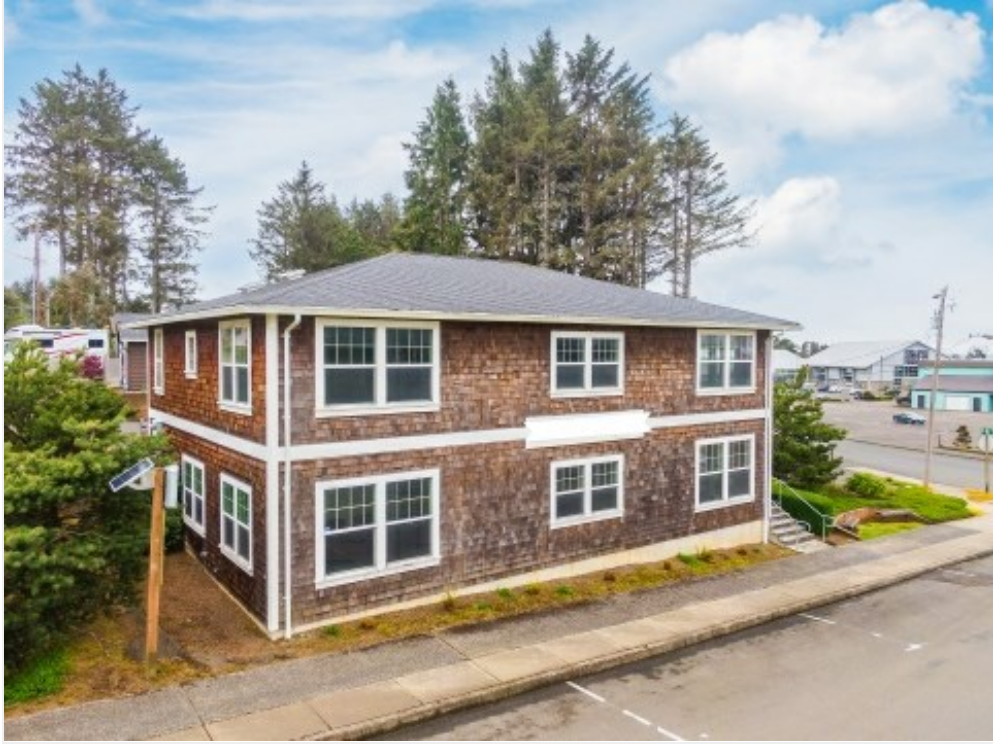
Edit East side