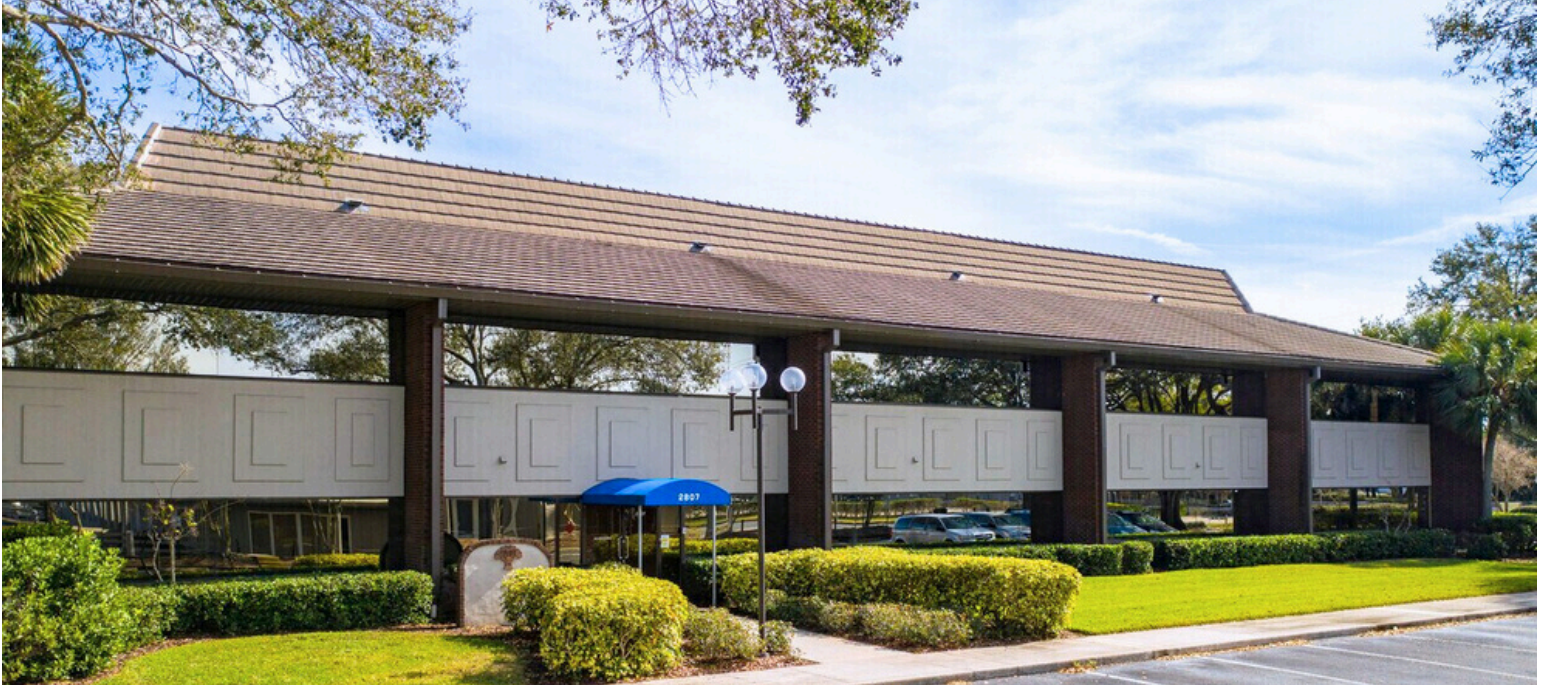
Orange Grove Commerce Park