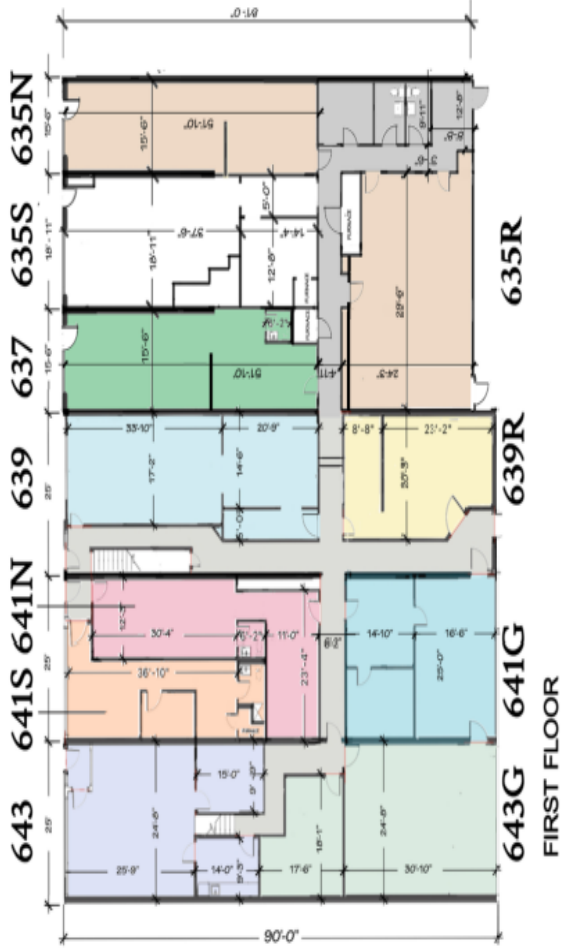
BUILDING GROSS SF: 12,600 SF