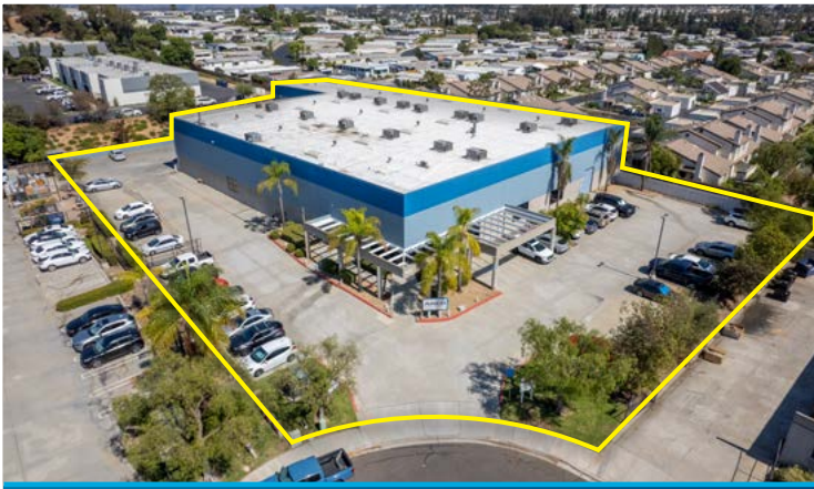
950 Borra Place - Escondido, CA 92029