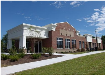
Medical Office Building, Union, KY