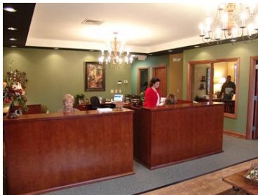
Surgery Center, Centerville, OH