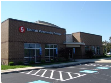
Community College, Mason, OH