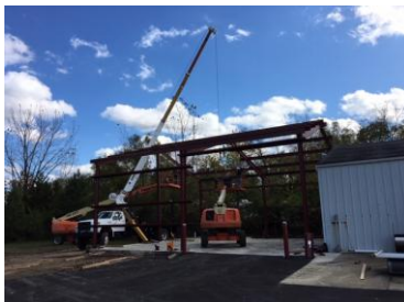
Industrial, Miamisburg, OH