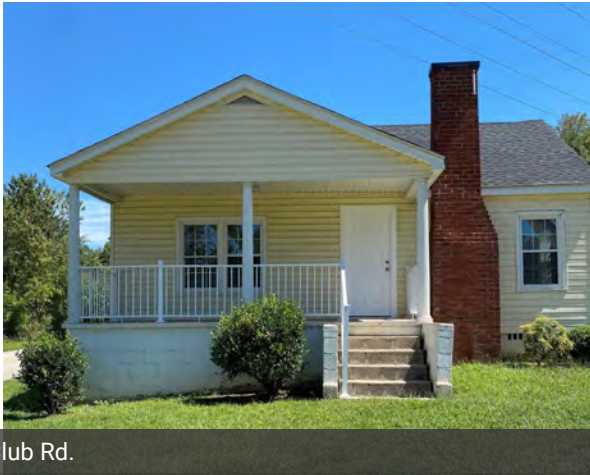
3995 Country Club Rd.