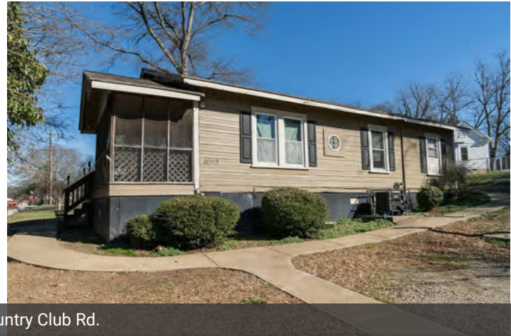
4095 Country Club Rd.