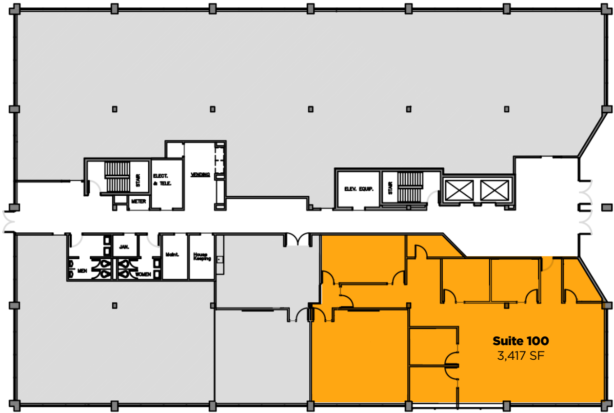
Plaza 45 - First Floor